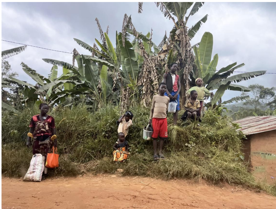
The ADF has been listed by the UN among the actors most responsible for abuses against children in the DRC, including abduction and recruitment and use.

Protocol II to the Geneva Conventions sets the minimum age for recruitment or use in armed conflict by all parties to the armed conflict at 15 years old. 249 More recently, The Optional Protocol to the Convention on the Rights of the Child on the Involvement of Children in Armed Conflict (OPAC), ratified by DRC on 11 November 2001, prohibits the recruitment or use in hostilities of persons under 18 years old, including by non-state armed groups. 250 The recruitment of children under 15 years old or their active participation in hostilities are war crimes. 251