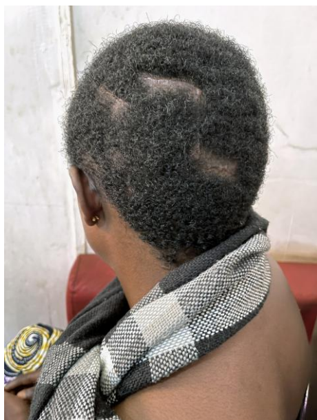
A woman described to Amnesty International surviving being hit in the head by a machete during an August 2025 attack by the ADF that left her three-year-old daughter dead and her house burned.

Her husband managed to escape; “they hit me on my head with a panga and I woke up [later] in the hospital,” she said. 82 Relatives “told me that [fighters] killed many people and burned many houses that day... They burned my house with my child inside... She was three years old”, the woman said of how her only child was killed. “When I try to ask my husband questions, he doesn’t respond, he starts crying... Since [then], I have been consumed by fear. The only thing on my mind is fear... I don’t even know fear of what.” 83