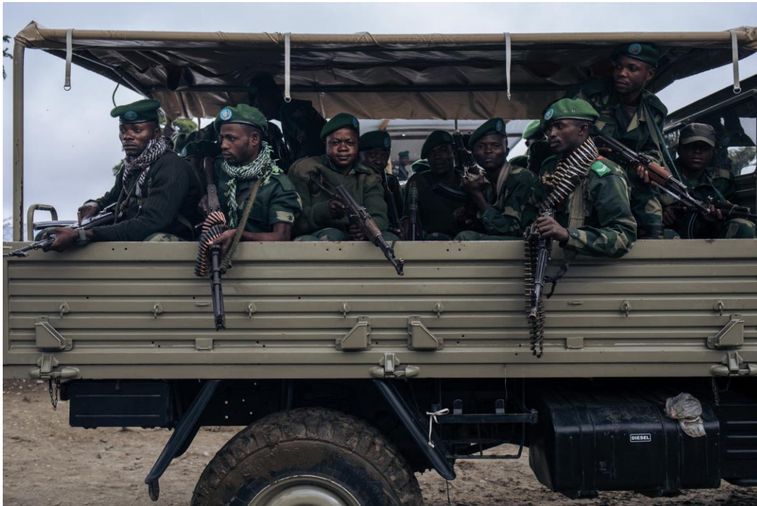
Soldiers conduct a rapid deployment exercise on 24 May 2021 on the outskirts of Mutwanga, which has been repeatedly attacked by the ADF.

Amnesty International did not investigate the legal basis of these detentions, but, prima face, the lengthy periods of and conditions in confinement are of concern. Further research into this issue is needed.