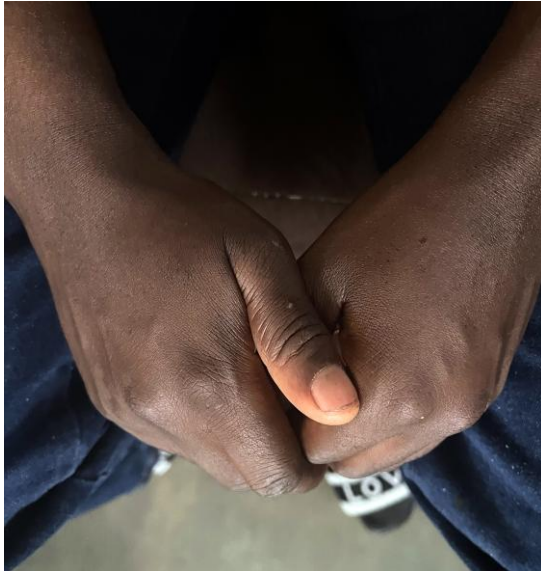
Amnesty International interviewed a woman who was abducted in 2025 and taken to one of ADF's camps where she was assigned to care for women who gave birth and their newborns.

Amnesty International interviewed a woman who was abducted in 2025 and taken to one of ADF's camps in Ituri. 194 There, camp supervisors determined she was not strong enough to carry food and instead assigned her the task of looking after women who gave birth and their newborns. 195 She recounted: