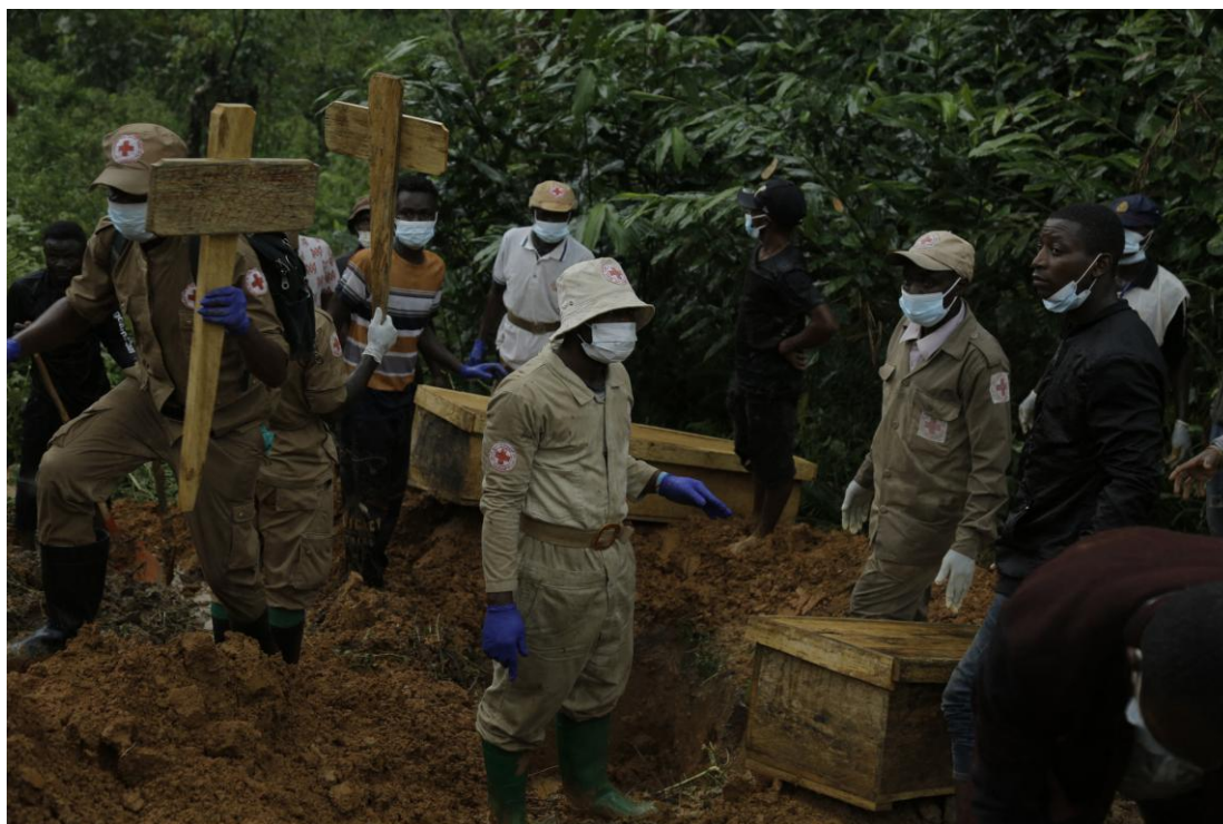
Red Cross volunteers gather around coffins containing the remains of victims during a burial ceremony in the village of Ntoyo, on 10 September 2025, after one of ADF's most horrific attacks of the year. Fighters killed more than 60 people in that attack.

While the group carries out attacks against security forces and pro-government armed groups, the vast majority of its attacks target civilians. The group's preaching has instructed "not only the permissibility but also the necessity of targeting civilians." 111 The existence of a modus operandi to attack civilian populations can be determined by patterns of attacks and public statements by ADF's leaders, 112 in furtherance of the organizational policy of establishing an Islamic State. It can also be inferred from the widespread and systematic nature of the attacks. To the extent that the prohibited act of murder was committed as part of a widespread or systematic attack on a civilian population, it amounts to a crime against humanity. 113