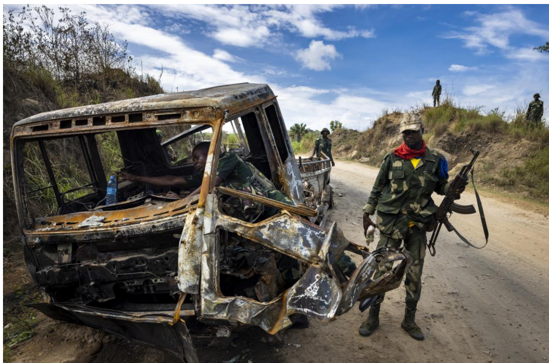
FARDC soldiers inspect the site of an ADF ambush on two vehicles on 7 April 2021 in Mbau. ADF fighters routinely abduct civilians during large-scale attacks as well as ambushes on roads and raids on farms.

Some of the abductees managed to escape, including during FARDC and UPDF operations. Several told Amnesty International that they ended up in Congolese and Ugandan military detention, sometimes for months, subjected to repeated interrogation.