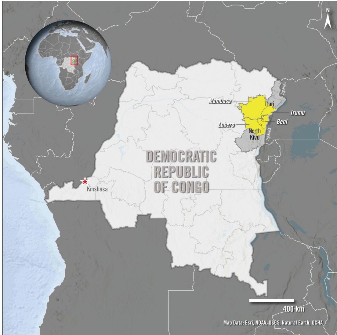
The map above shows the four territories – highlighted in yellow – within North Kivu and Ituri provinces where Amnesty International documented abuses by the ADF.