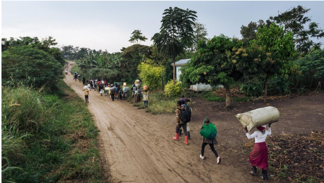
ADF's sustained campaign of violence has exacerbated the humanitarian crisis in the eastern DRC, including by causing more displacement of civilians.