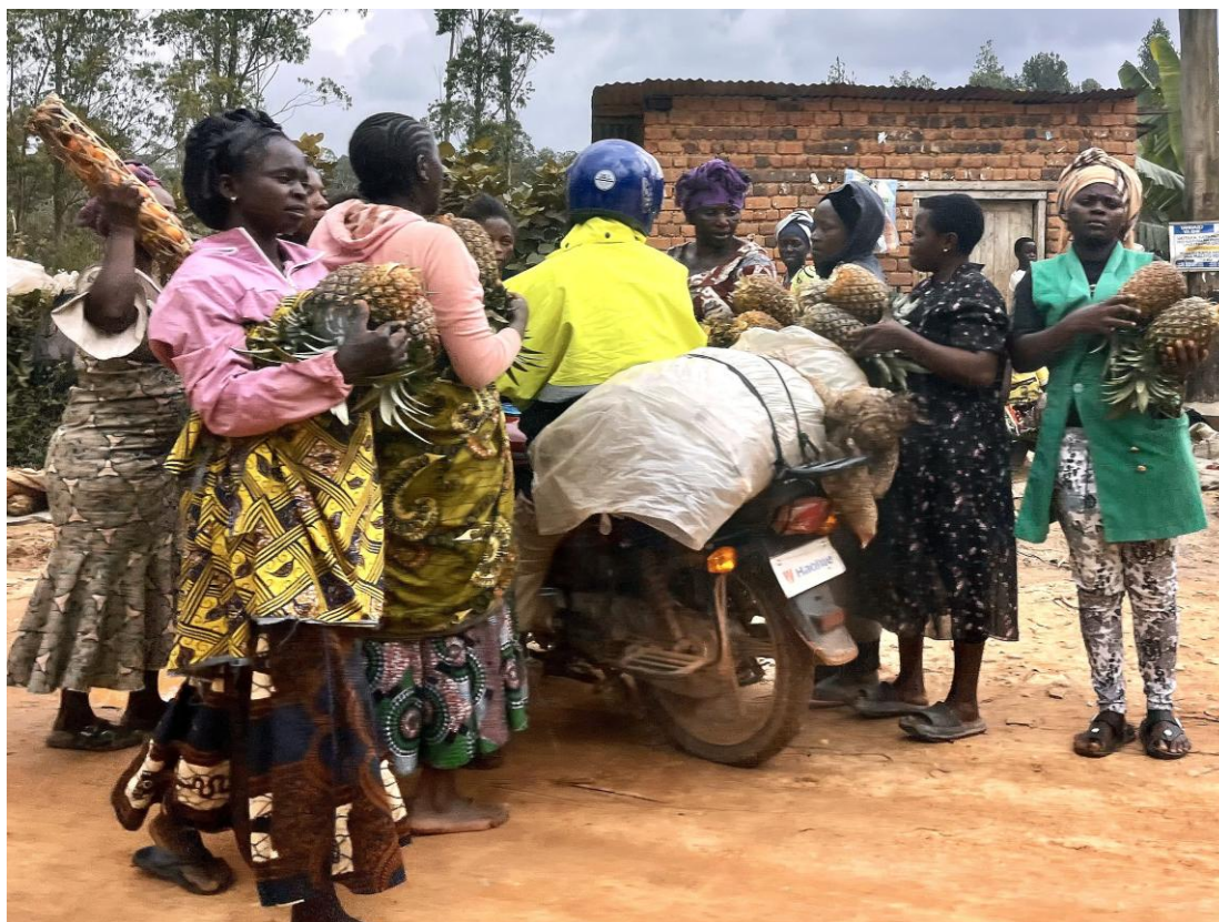
The ADF has systematically abducted women and girls and subjected them to forced marriage, sexual slavery and other serious violations.

Amnesty International's interviews show that the women and girls were prohibited from exercising any agency whatsoever over decision-making pertaining to their bodies or otherwise, including reproductive choices, and were subjected to domestic servitude and extended periods of sexual and physical violence. Forced marriage and forced pregnancy, as well as a slew of other abuses associated with them, amount to war crimes and crimes against humanity.