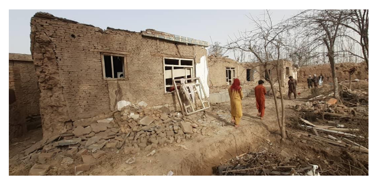
The same home, looking to the northwest.

At the time of the attack, a total of 27 people were sleeping in the compound, 25 from the family who lived there, and two guests visiting from out of town. The first weapon hit the guesthouse, along the outer wall of the compound. The blast killed Mohammad Bashir, a 23-year-old engineer, and Hajra bint Abdul Ghayyur, his 3-month-old niece. After the detonation, people inside the guest house fled out into the courtyard, and met other family members who were sleeping in the main quarters, a long low building consisting of a series of rooms and exterior patio. These civilians took refuge in two small buildings along the compound wall, one that kept goats and other livestock, and another that contained a furnace and wood for heating. "I told the women and children to go to other places, to spread out" said one man, a witness. "We expected another bomb, because whenever people gather after one bomb they get hit again. The Americans do it." The second air strike hit the livestock shelter, killing three and wounding another six.