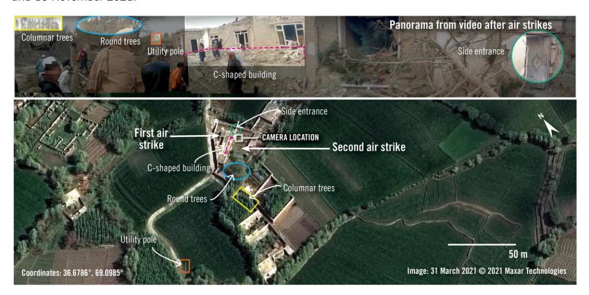
A panorama of a video acquired by Amnesty International shows damage from two air strikes on a compound in Kunduz Province, Afghanistan. The panorama highlights features from the video, that were aligned with the satellite imagery.

precisely geolocate the home, and satellite imagery corroborates that the compound was struck between 7 and 16 November 2021.