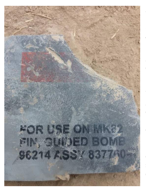
The front wing of a GBU-12 500lb Paveway II laser guided bomb that was discovered in the wreckage of the home.

Another photograph provided by the witnesses shows scrap recovered at the scene, including the front wing of a GBU-12 500 pound Paveway II laser guided bomb, with a Commercial and Government Entity (CAGE) code of 96214, indicating that it was manufactured by Raytheon. 148