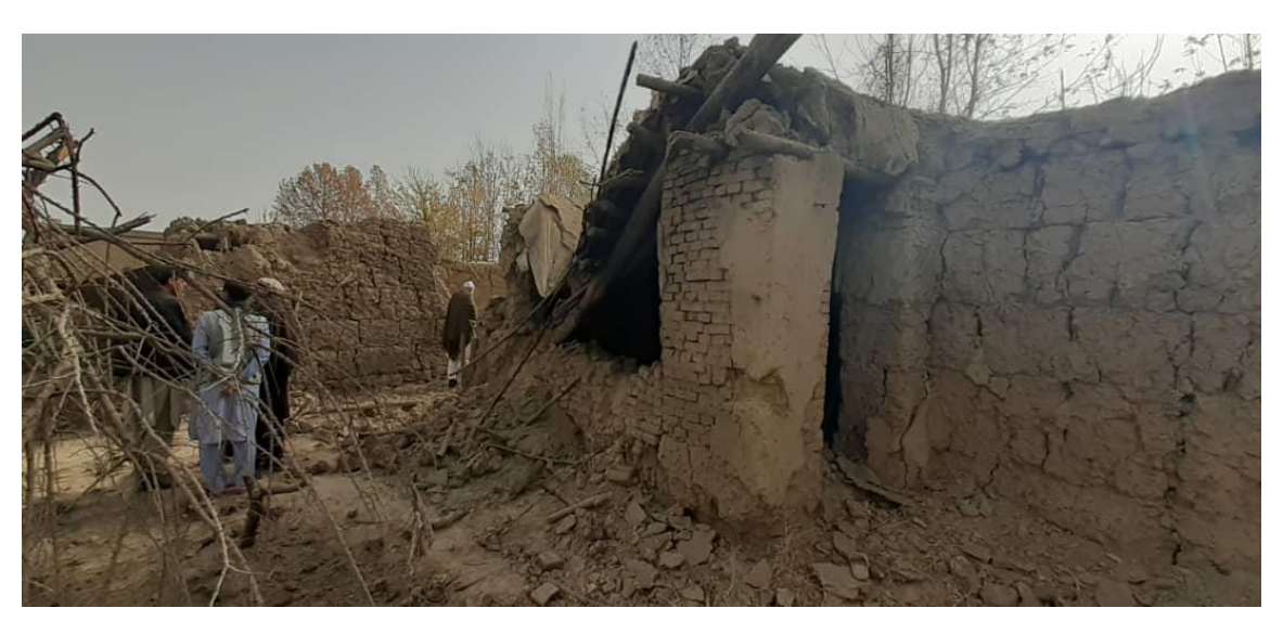
The home destroyed by the first air strike, looking southwest.

Just after midnight, a witness who was in the home heard planes begin to circle overhead. 138 About 20 minutes later, the first bomb struck the family compound. The aircraft continued to circle, and the second air strike impacted 15 minutes later.