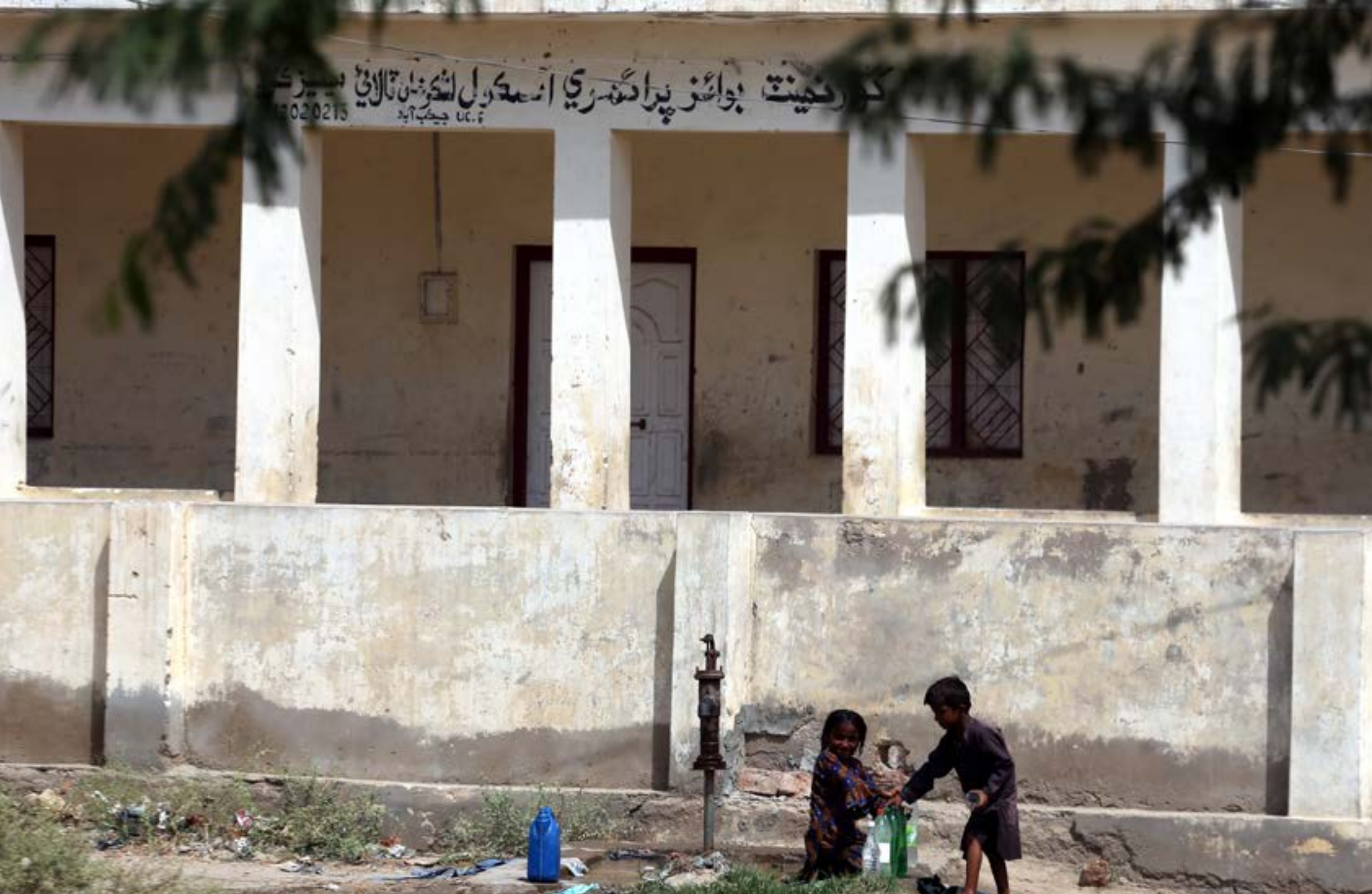
Children fill water bottles outside a closed government school, most of which remain poorly equipped to protect students from the heat. The absence of a public transport system forces children to walk to school in the heat, or if they can afford it, a shared taxi. This leads to students dropping out.