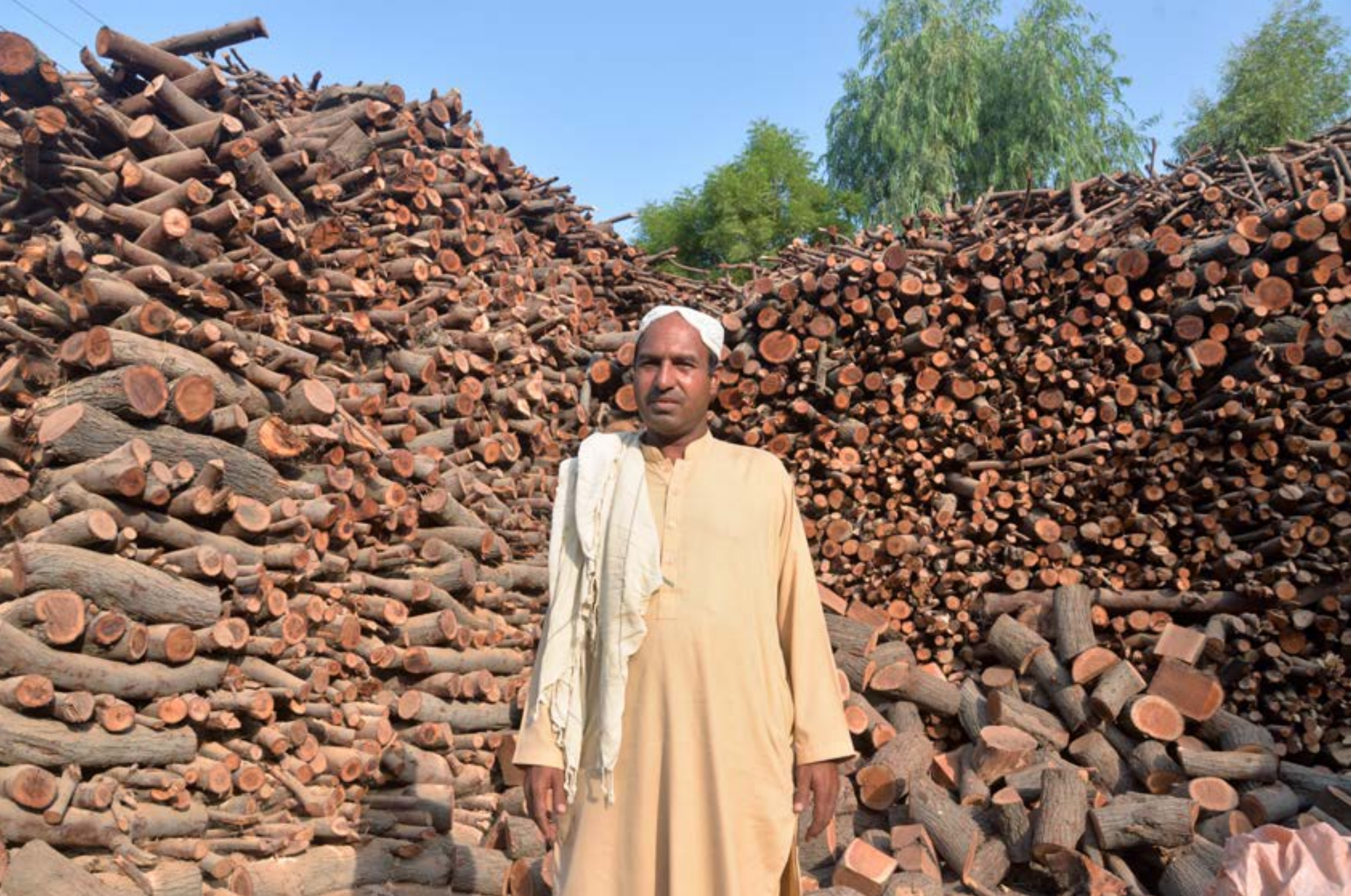
Firewood remains the primary energy source for many, significantly reducing the city's tree cover.