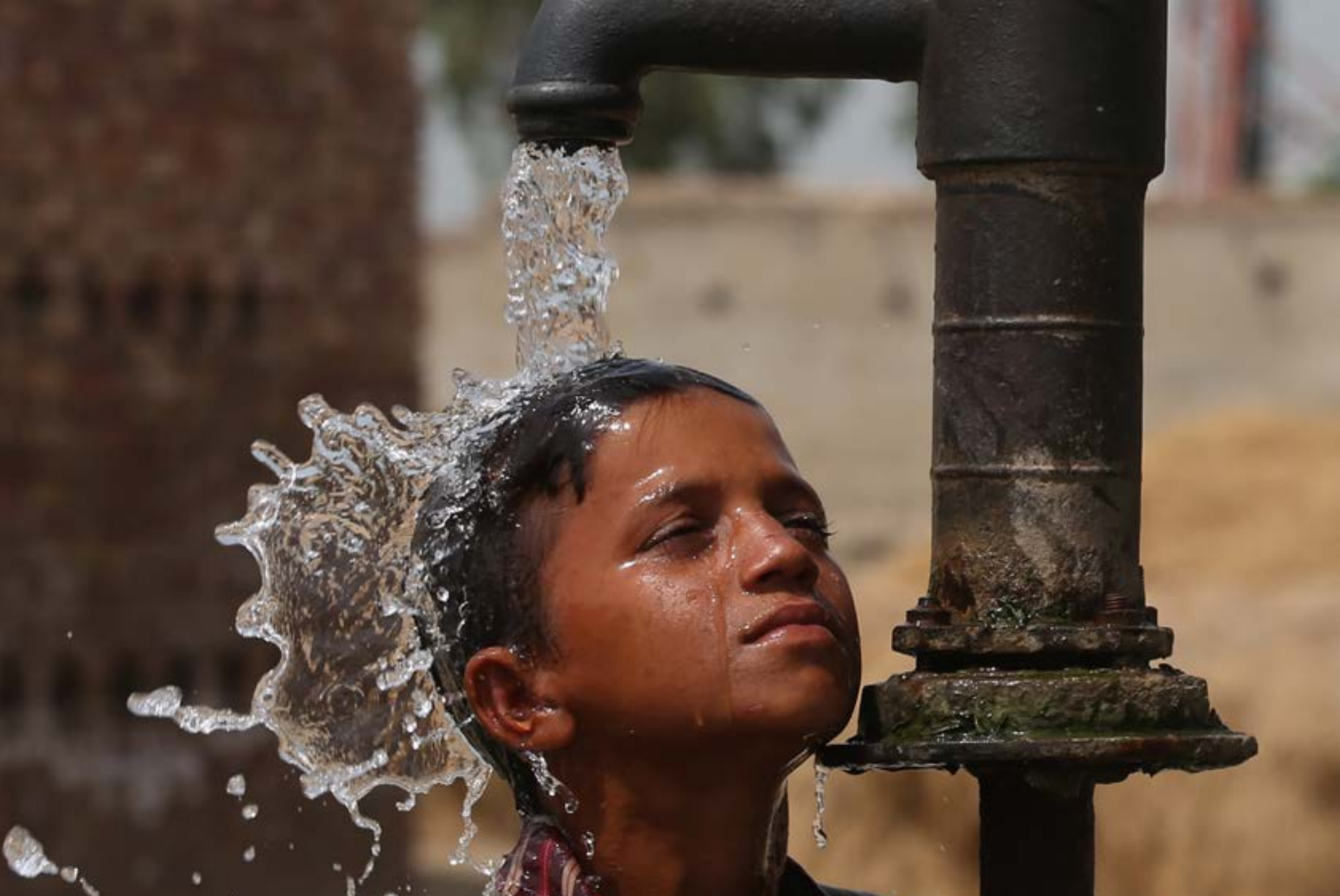
A child cools off with a hand-operated pump, his only respite in searing temperatures.