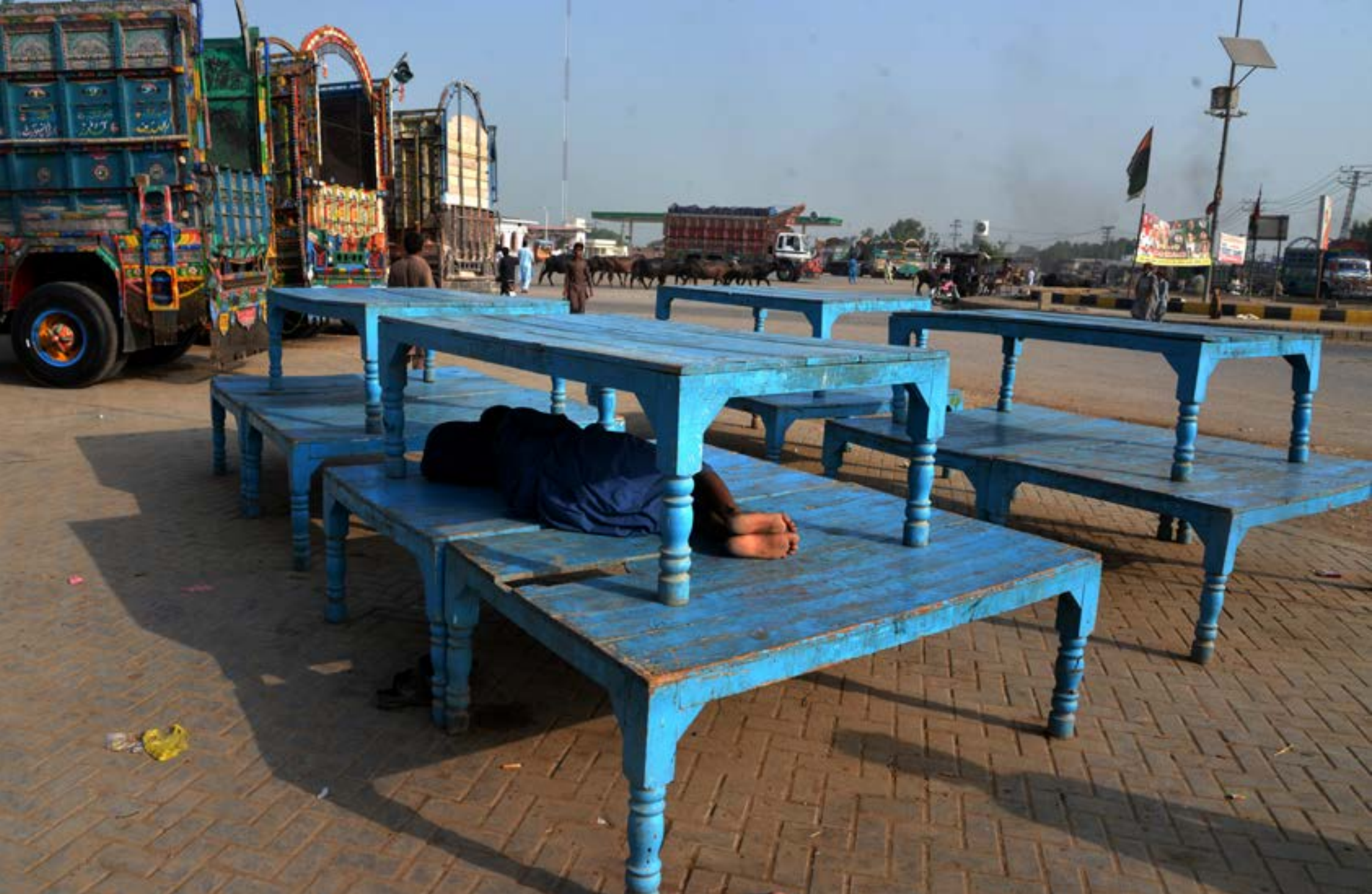
A truck driver takes a nap under stacked tables in the blazing heat. Most labourers take a break during the afternoon, when the sun is at its hottest, but this can lead to reduced wages.