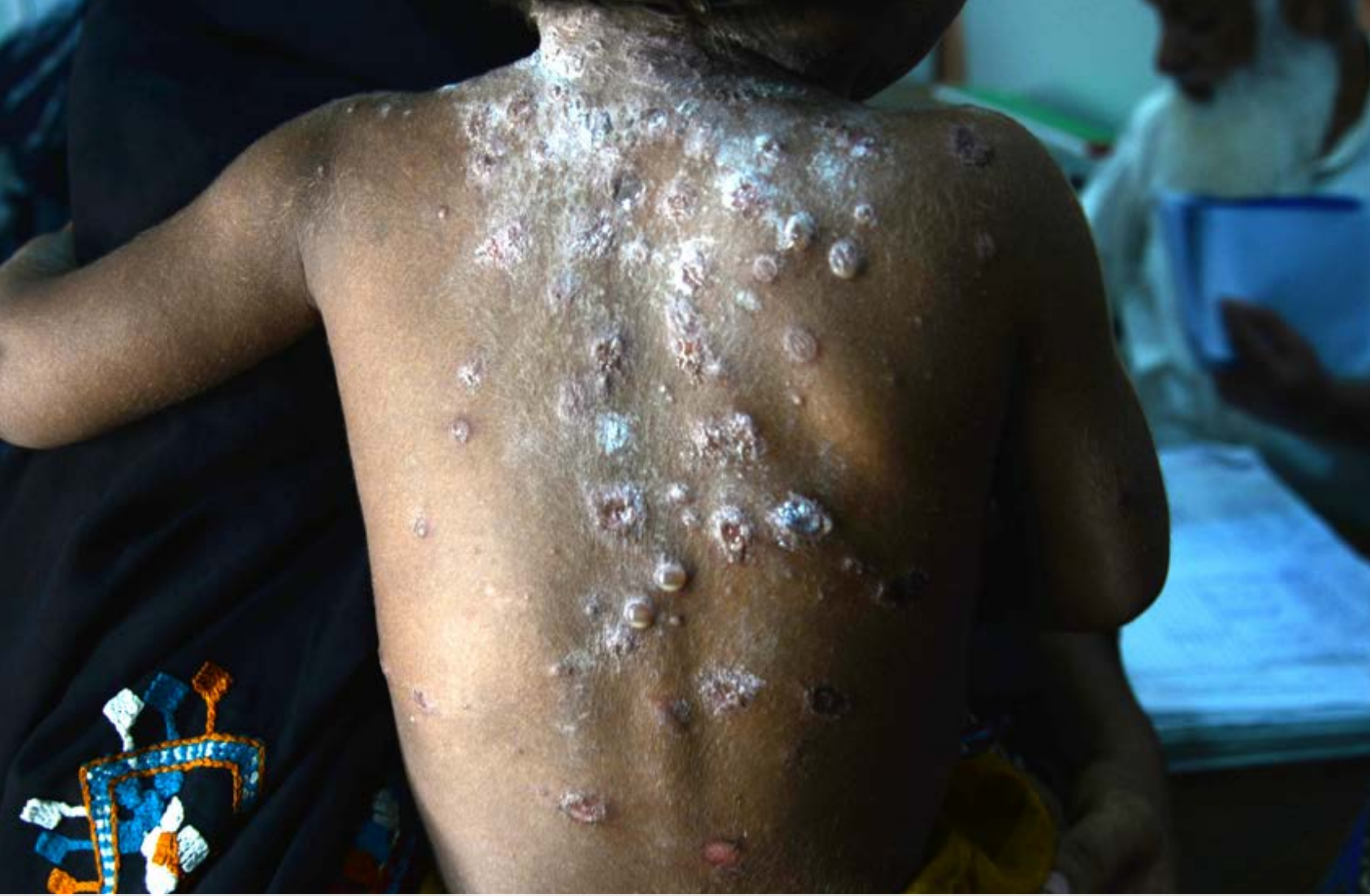
A toddler receives treatment at a clinic for a skin condition caused by exposure to the sun. Extreme heat, dirty water and poor hygiene practices have led to many residents of the city developing skin issues.