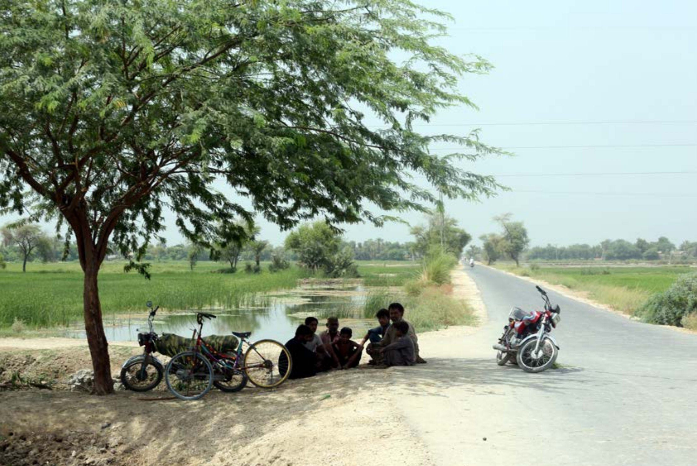
People huddle under a tree, one of the few remaining, that offers them shade.