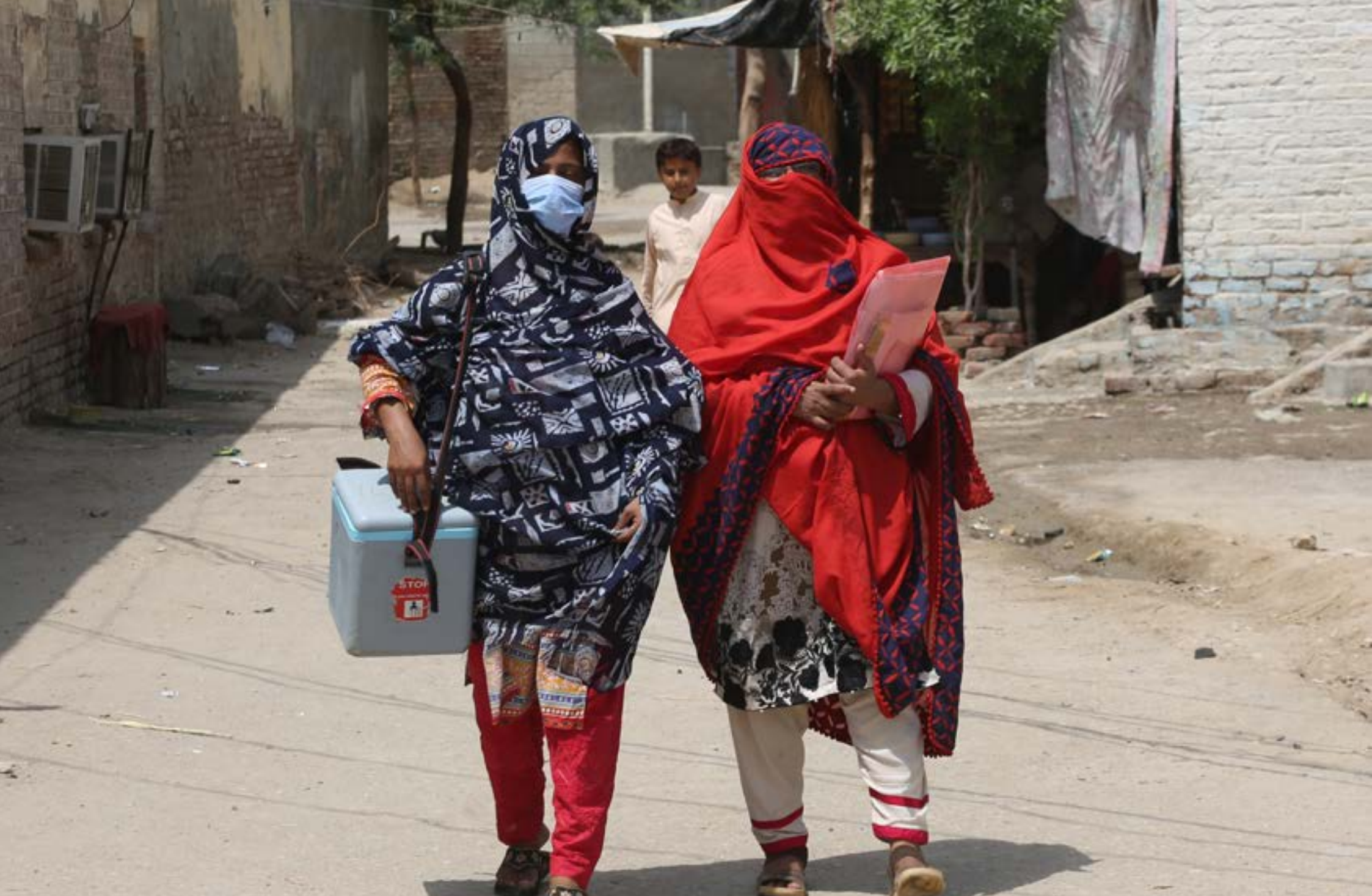
Community health workers making their rounds that they must complete by 4:00 pm to submit their daily progress reports on time at their offices.