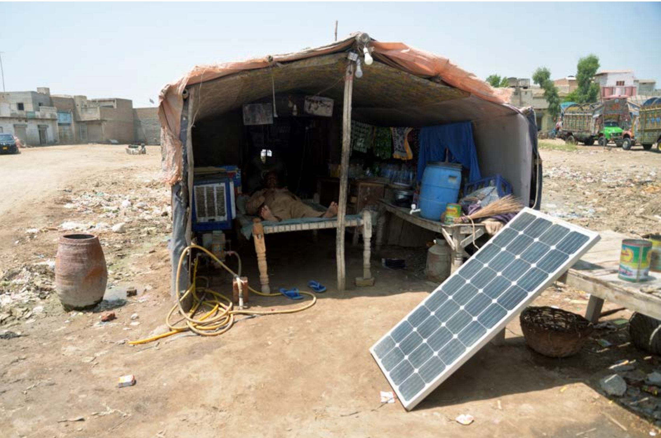
A man takes shelter – he remains one of the more fortunate, with solar panels and shade.