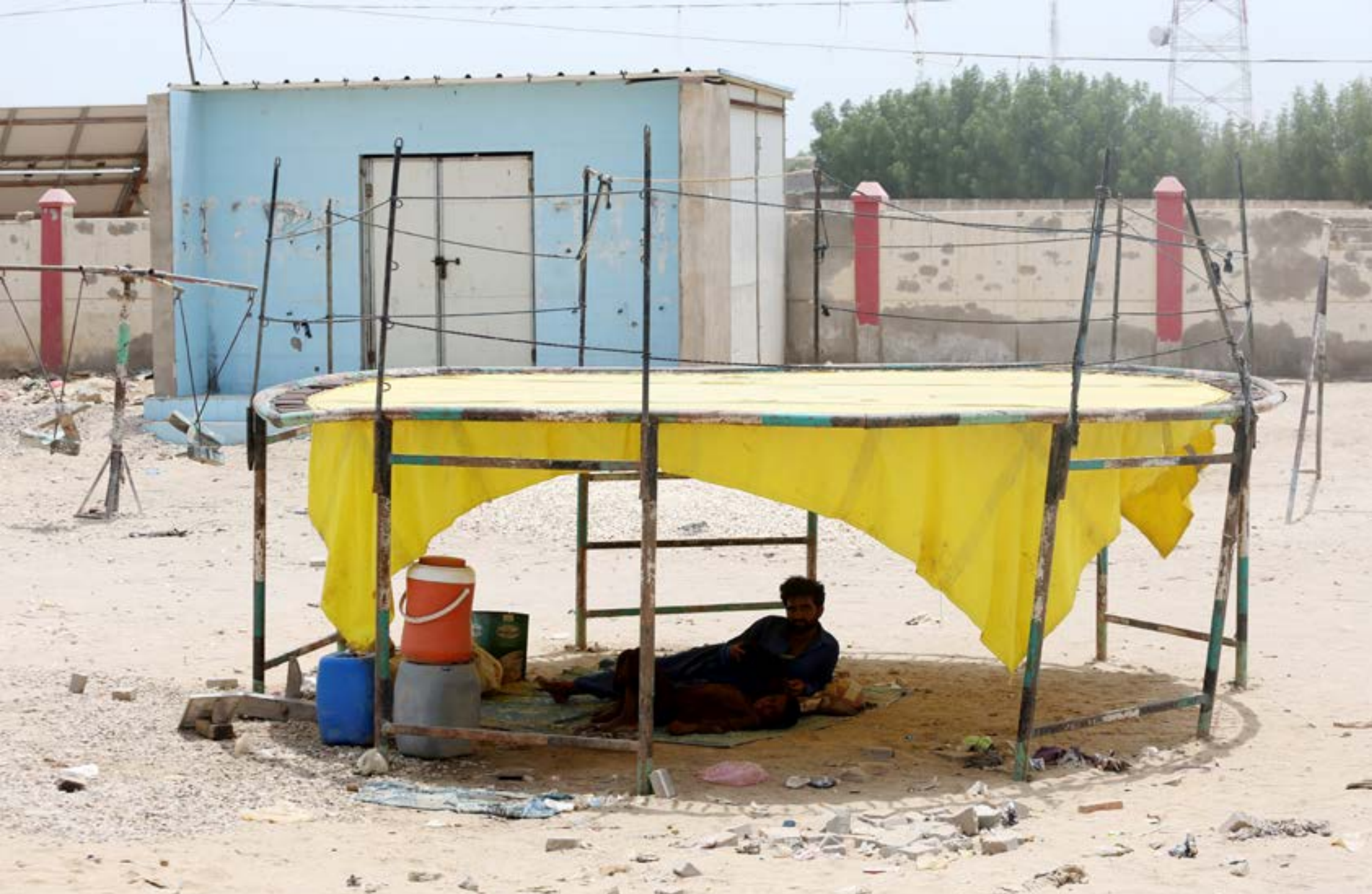
A man makes a makeshift shelter from a discarded trampoline. Shade has become increasingly difficult to find with unchecked deforestation and residents make do with whatever they can find.