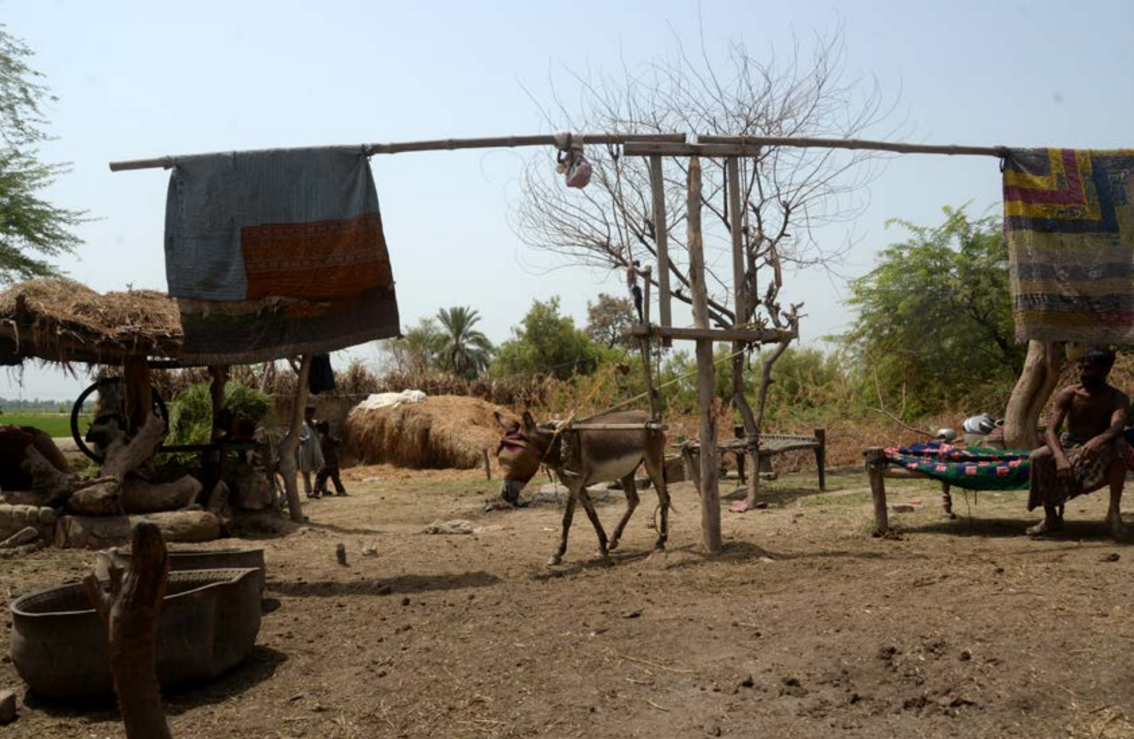
Some families have created “donkey-powered fans” where a donkey is blindfolded and tied to a pole and made to move in circles, rotating an axle with two light blankets on them.