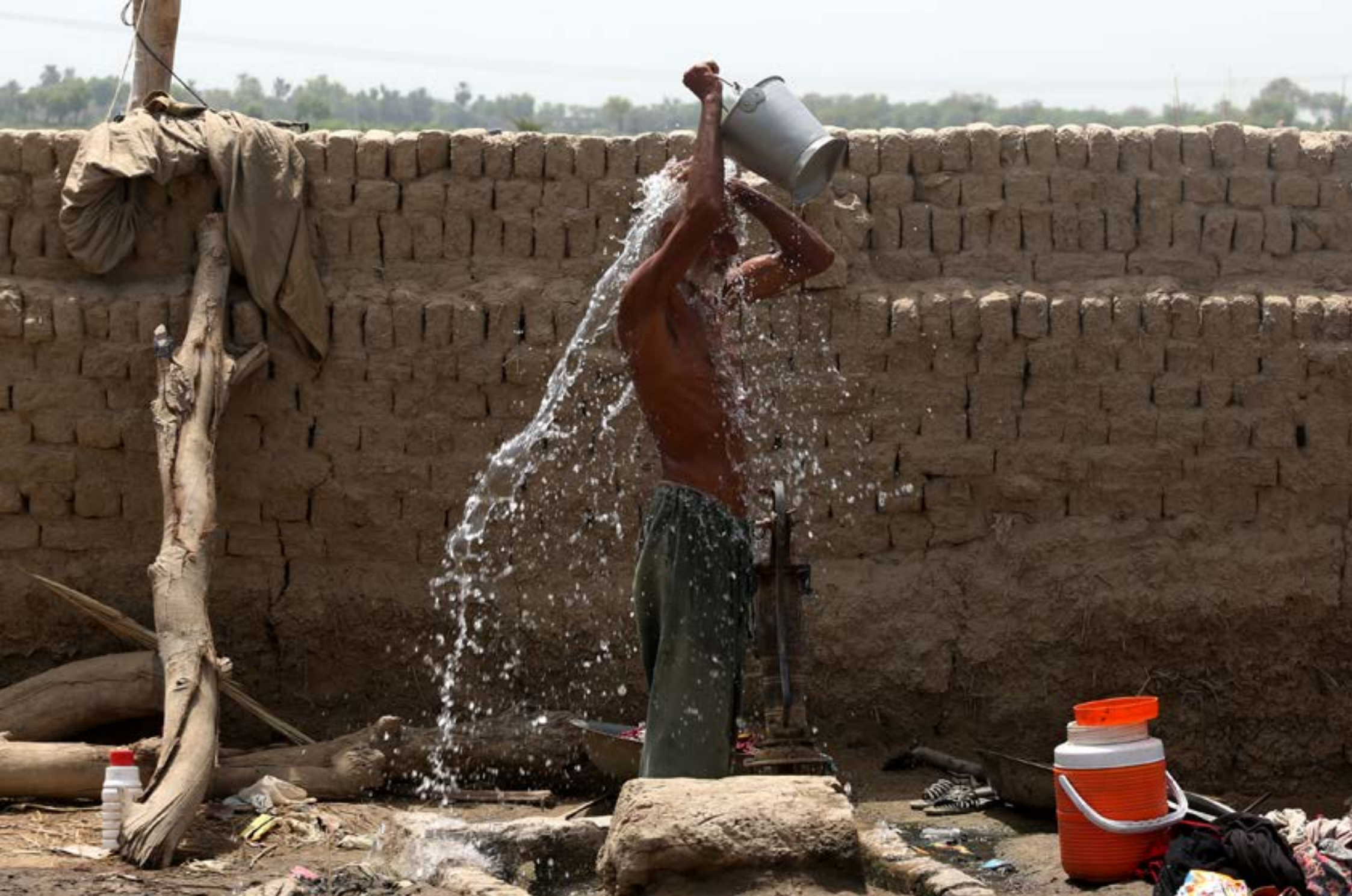
A 70-year-old brick kiln worker cools off.