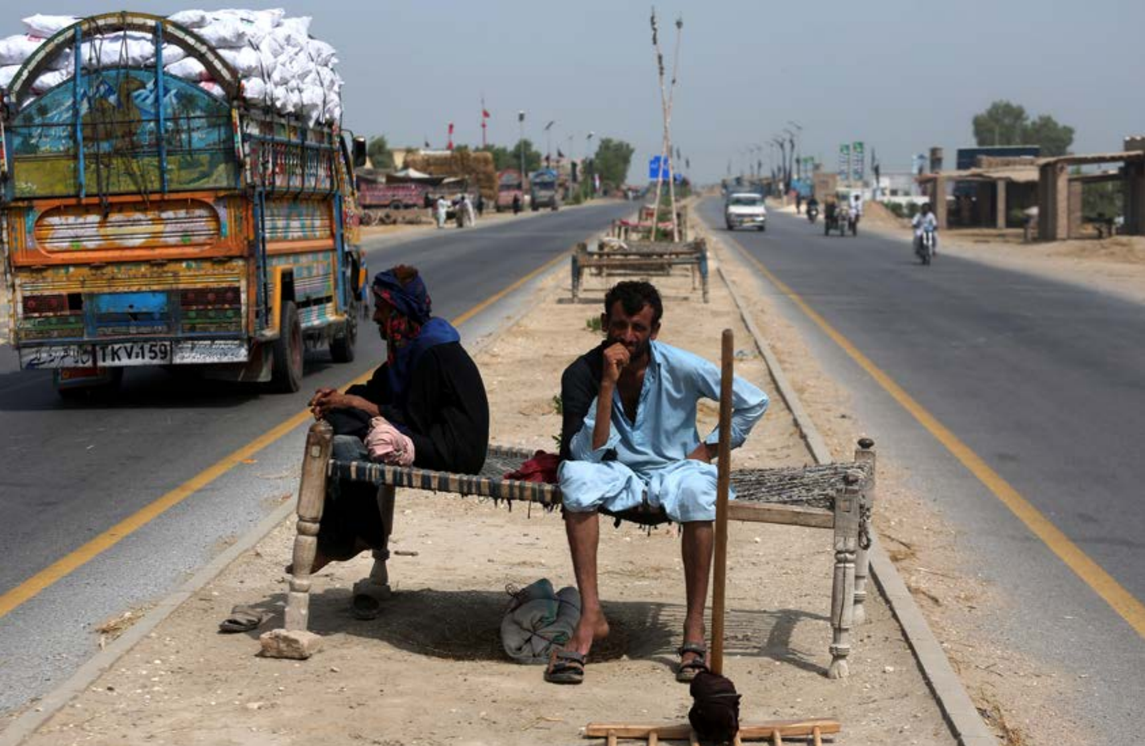
The most indigent often resort to the footpath to sleep. Many labourers and families place their charpoy on the divider on two-way roads so that gusts of wind from passing vehicles offer them some respite, even as they are forced to breathe toxic fumes from car emissions.