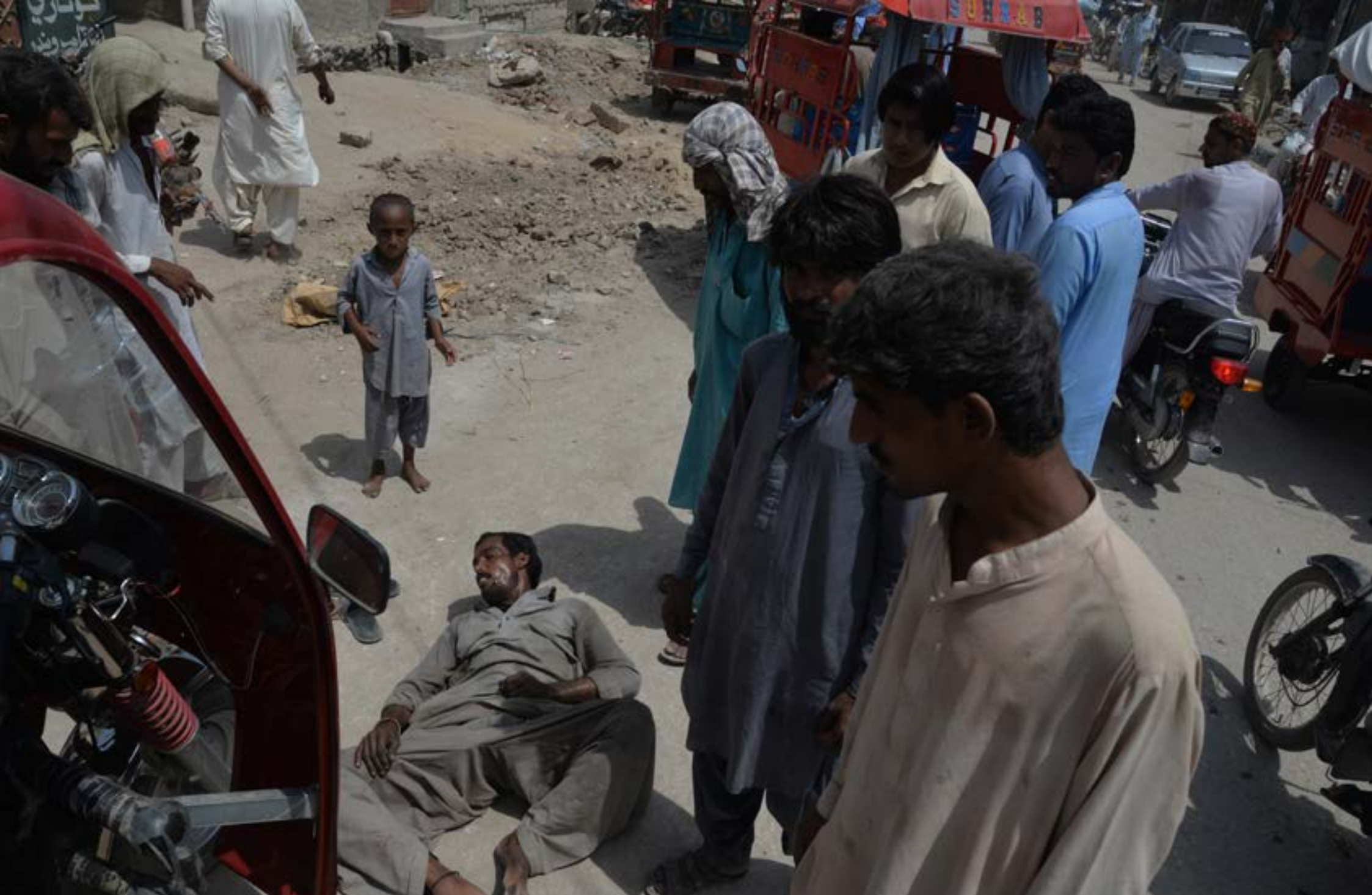
A man passes out from a heatstroke in the middle of the road, a commonplace occurrence in the hottest months where temperatures have exceeded 50 degrees Celsius for the last four years.