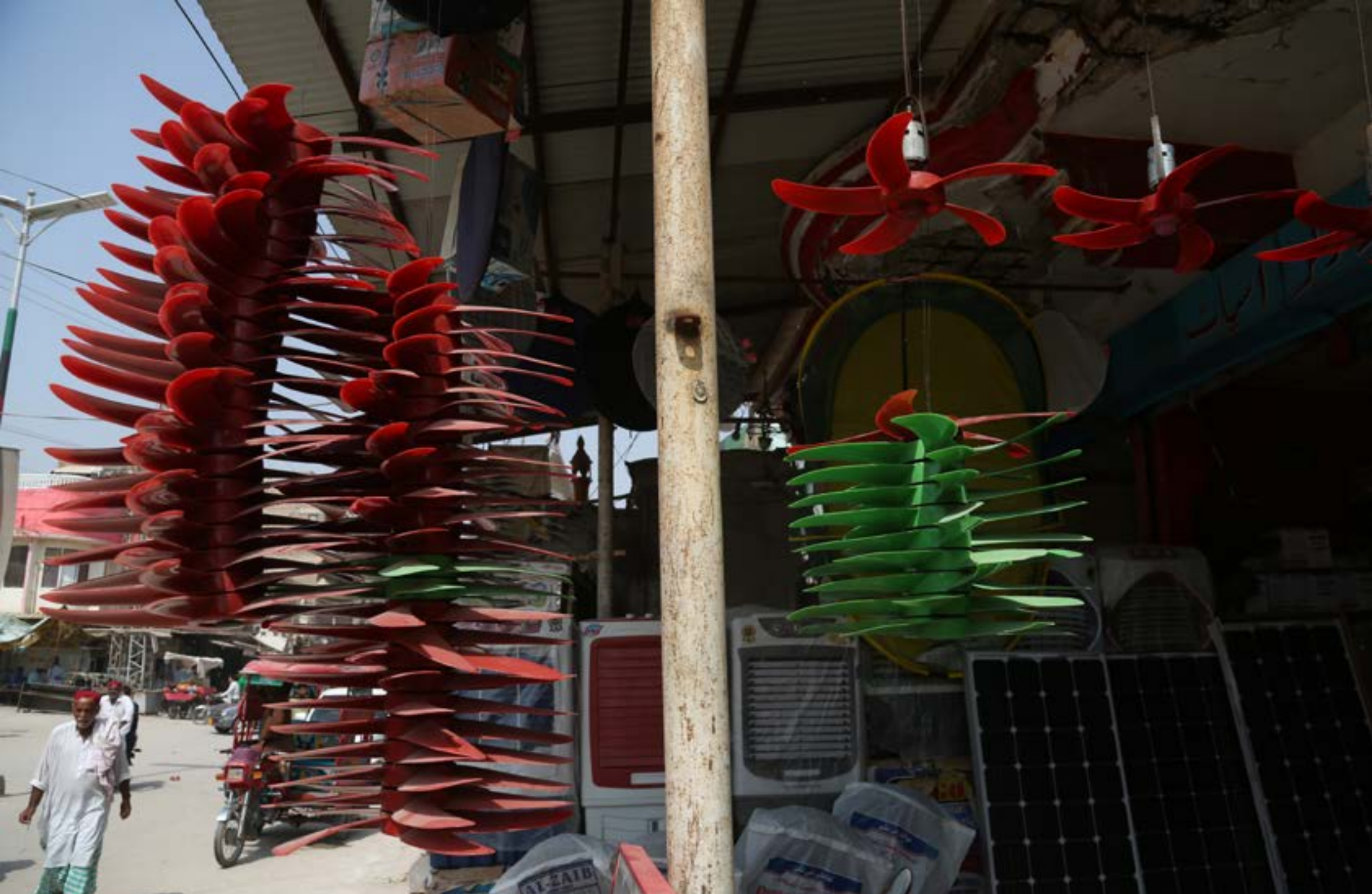
Despite an abundance of sunlight, solar power is still prohibitively expensive for the majority of Jacobabad's residents.