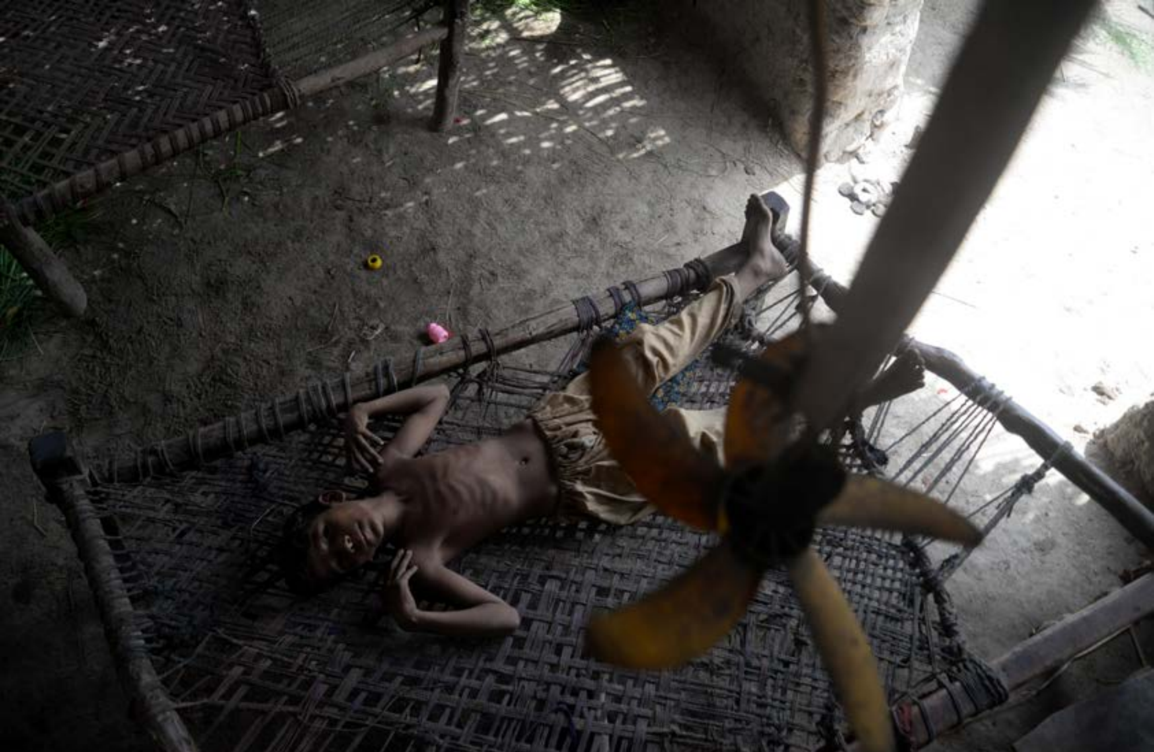
An emaciated child seeks relief under a solar-powered fan, charged by a small battery in his home, which is only functional during the daytime.