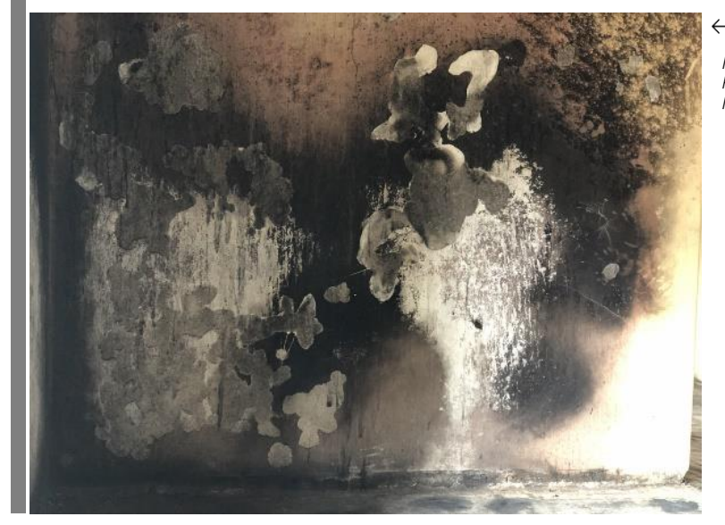
A photograph of burn marks on a wall taken by Amnesty International in the North Western Province, following the violence on 13 May 2019

A photograph of the damage to metal sheeting taken by Amnesty International in the Western Province, following the violence on 13 May 2019