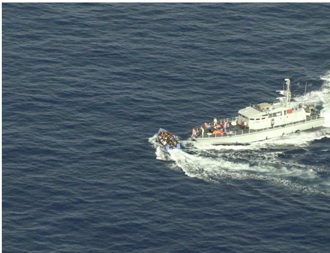
LCG vessel Ras Jadir nearly rams into a migrant boat on 30 June 2021.

Refugees and migrants interviewed by Amnesty International noted reckless, negligent and unlawful behaviour by Libyan officials involved in interceptions at sea that put their lives at risk, rather than showing concern for their lives and safety. These findings are consistent with past documentation on LCG violent and reckless conduct towards refugees and migrants at sea by Amnesty International 114 as well as other human rights bodies. In a report examining patterns of interceptions and rescues at sea between January 2019 and December 2020, OHCHR reported that interviewed refugees and migrants said the LCG had hit or shot at their boats and that they faced kicking, punching or other violence during such interceptions, behaviour that put their lives at risk. 115 In a 2018 joint report, the OHCHR and UNSMIL also identified “a pattern of reckless and violent behaviour” by the LCG. 116