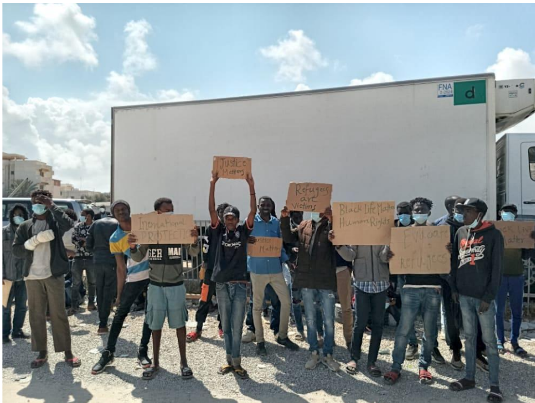
Refugees protest outside UNHCR's office in Tripoli, Libya, in April 2021, requesting protection, support and information about the status of their cases