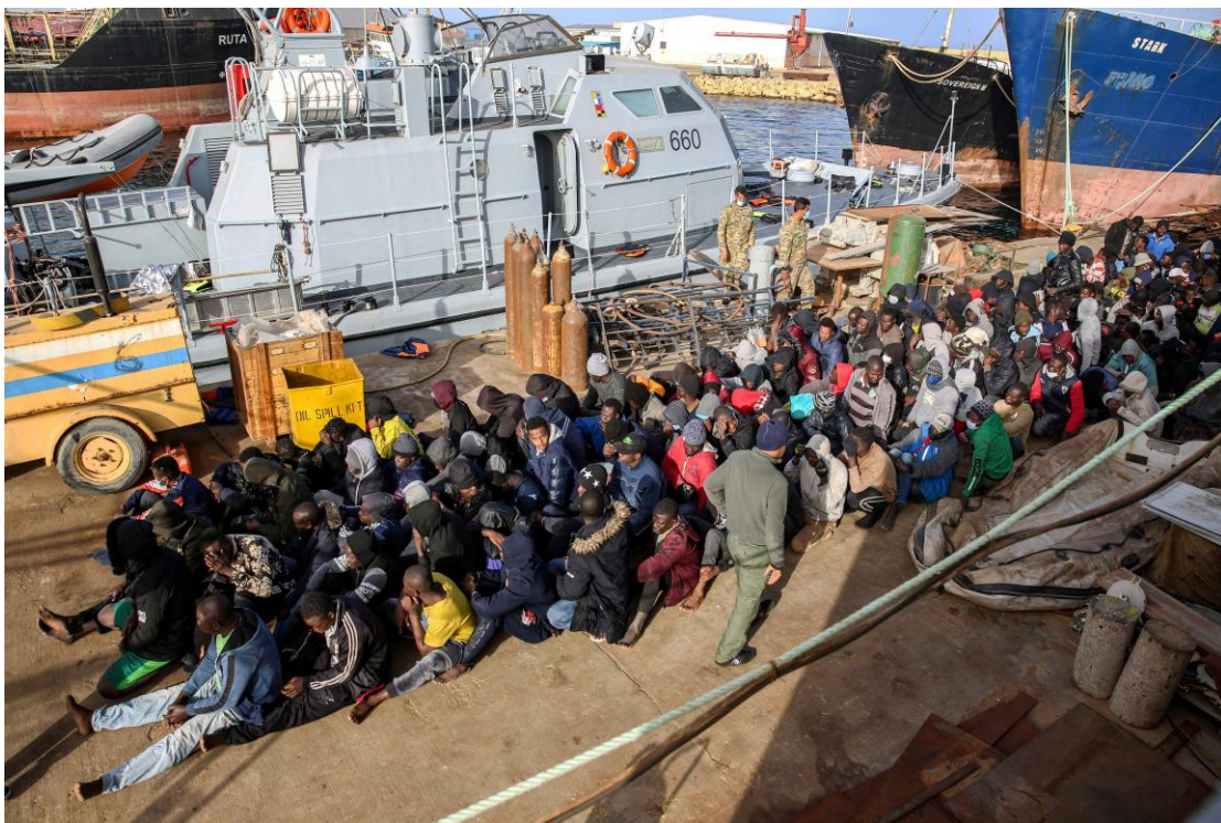
Refugees and migrants intercepted at sea by the LCG are disembarked in the Tripoli naval base on 10 February 2021.

Libyan authorities fail to uphold the rights of disembarked refugees and migrants and hamper the ability of UNHCR and humanitarian actors to provide protection aimed at ensuring their human rights, including their right to claim international protection, their right to dignity and security of person, their right to be protected from torture and other ill-treatment and their right to health. Instead, disembarked refugees and migrants are rushed into abusive indefinite arbitrary detention with no possibility to challenge its lawfulness.