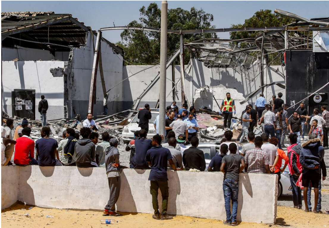
Refugees and migrants outside the former Tajoura DCIM centre following 2 July 2019 airstrikes on the site.