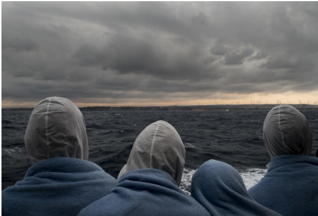
Migrants and refugees look toward Italy after being rescued in the central Mediterranean by an NGO on 3 November 2017.

“The simplest human right in the world is to be able to hear the voice of your child or the voice of your mother, no? [DCIM guards] weren't even letting us speak to our families. [Only] every five months, when UNHCR came to the prison, I would be able to hear my mother's voice”