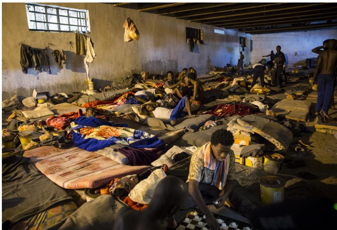
Detained migrants and refugees in a Tripoli detention centre on 8 June 2017.

Consistent with long documented patterns of abuse, in 2020 and 2021 the Libyan authorities held individuals returned from sea to arbitrary and indefinite detention in DCIM centres, and systematically subjected them to torture and other ill-treatment, frequently for the aim of extracting ransoms; sexual or gender-based violence; forced labour and other exploitation; and cruel and inhuman detention conditions that in themselves violate the absolute probation of torture and other ill-treatment. DCIM officials and other armed men in uniform or civilian dress present in detention centres routinely resorted to unlawful lethal force against detained refugees and migrants, sometimes leading to killings and injuries. Refugees and migrants also remained vulnerable to being forcibly disappeared from DCIM detention centres.