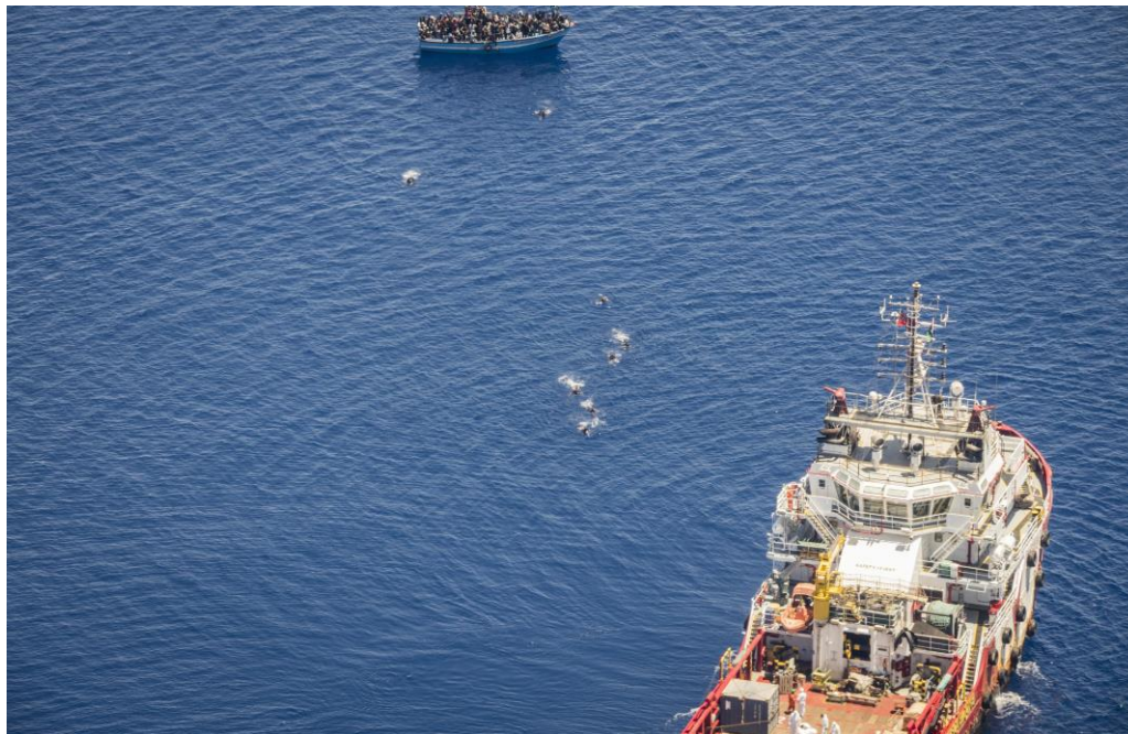
Refugees and migrants attempt to reach safety by swimming in the direction of the merchant ship Vos Triton on 14 June 2021.