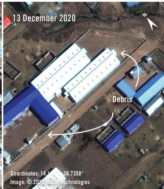
Debris consistent with looting around buildings that appear to be warehouses or industrial facilities, on the southern edges of Axum, shown on satellite imagery from 13 December 2020. Eritrean forces systematically looted the city. Residents said Eritrean soldiers stole sugar and flour from a store called Guna Trading; that they robbed May Akko, a large community store, of truckloads of sugar, cooking oil and lentils, and that they took flour and animal fodder from the Dejen Flour Factory.

The soldiers stole luxury goods, machinery (such as generators and water pumps), vehicles (including bicycles, trucks, three-wheel vehicles, and cars, sometimes taken from their garage), as well as medication, furniture, household items, food, and drink. "They looted whatever they could get. If they got mango juice, they would drink it and then carry things on the truck," a man said. 101