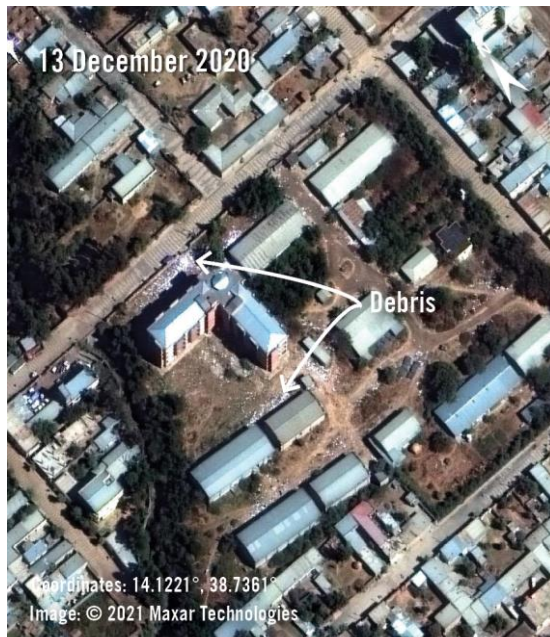
Debris consistent with looting around an unidentified building in central Axum, shown on satellite imagery from 13 December 2020. According to residents, Eritrean soldiers looted the university, private houses, hotels, hospitals, grain storage facilities, petrol stations, banks, electrical and maintenance stores, supermarkets, bakeries, jewelries, vendors' shacks (known locally as "containers"), and other shops, breaking through entrance doors with automatic weapons.