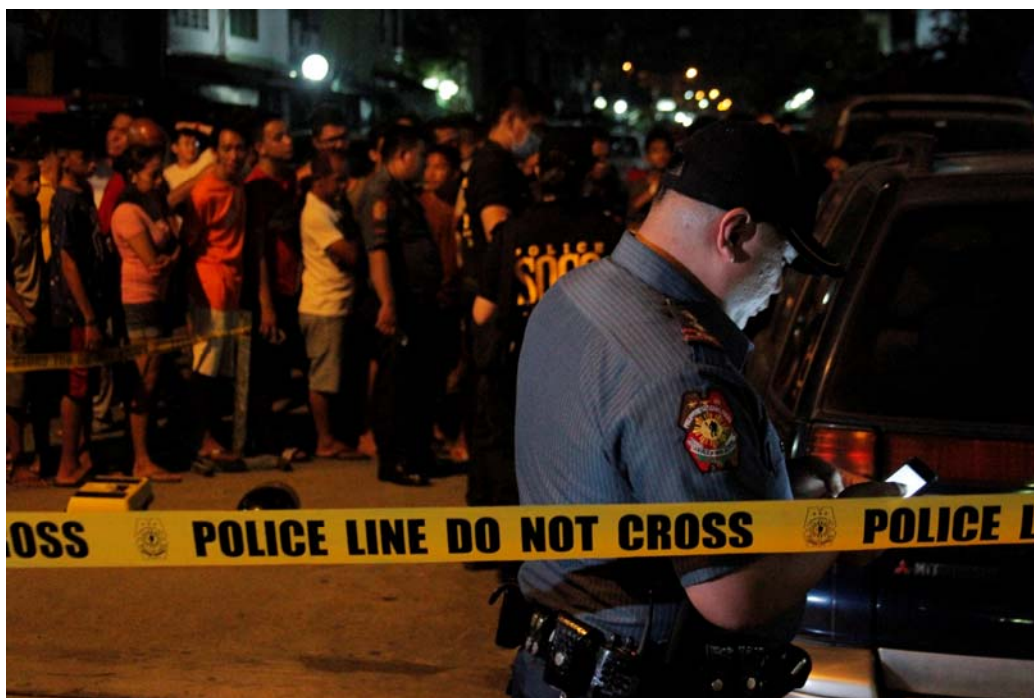
A policeman waits at the scene of an anti-drug police operation, 17 August 2017, Manila.