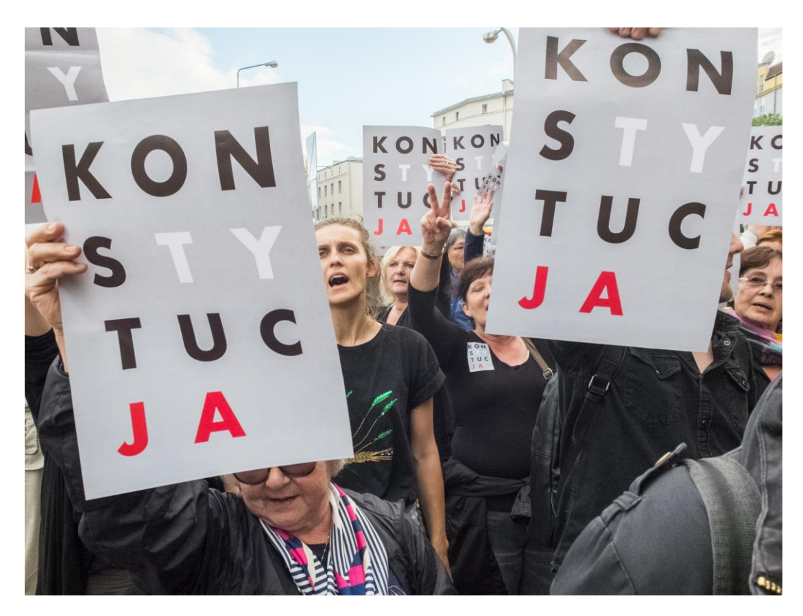
Demonstration against the laws infringing the independence of the judiciary outside the ruling party "Law and Justice" headquarters in Warsaw, 26 July 2017. The placards read: "Constitution".