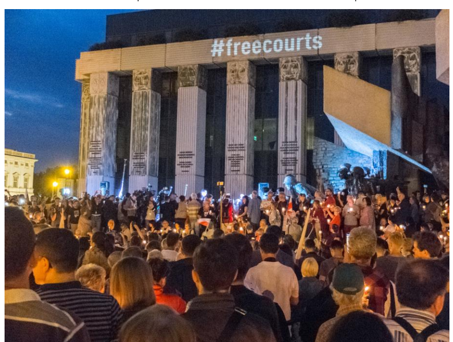
Protest in front of the Supreme Court on 16 July 2017 in Warsaw.

In early hours of 26 April 2019, MPs adopted another amendment to the Law on the Supreme Court. This amendment provides for the discontinuation of the appeal of the three Supreme Court judges who were forced to retire under the previous amendment to the Law on the Supreme Court.<sup>161</sup>