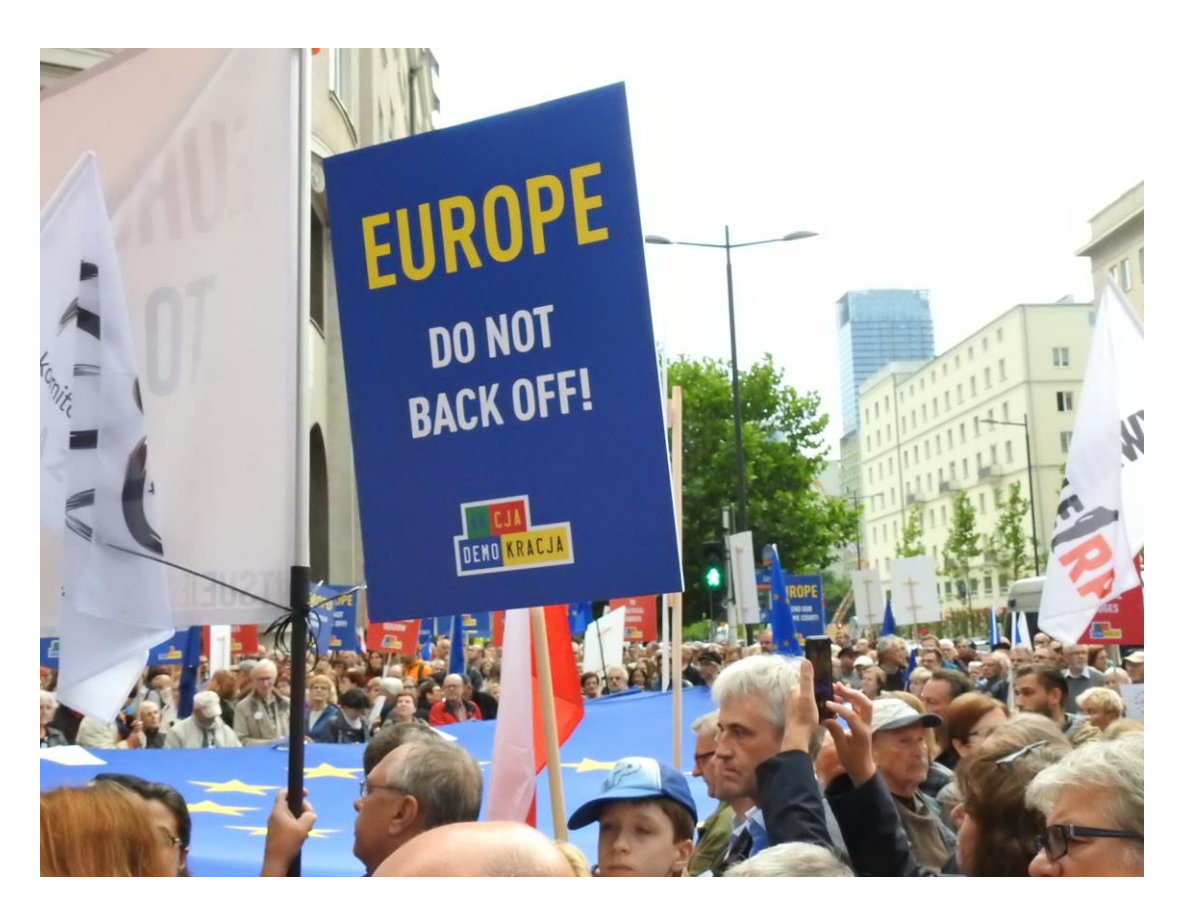
Assembly in front of the European Commission Representation Office in Poland on 25 June 2018, calling on Europe to continue to urge Poland to uphold the rule of law.

Article 19(1) of the Treaty on European Union, read in connection with Article 47 of the Charter of Fundamental Rights of the European Union, requires that member states, including Poland, guarantee the right to an effective remedy before an independent and impartial court. The new disciplinary proceedings characterized by extensive powers of the Minister of Justice, and the special position of the Disciplinary Chamber of the Supreme Court, <sup>173</sup> led the European Commission to a conclusion in April 2019 that Poland does not comply with the EU law. Specifically, the EC considered that the Disciplinary Chamber of the Supreme Court is not an independent body. <sup>174</sup>