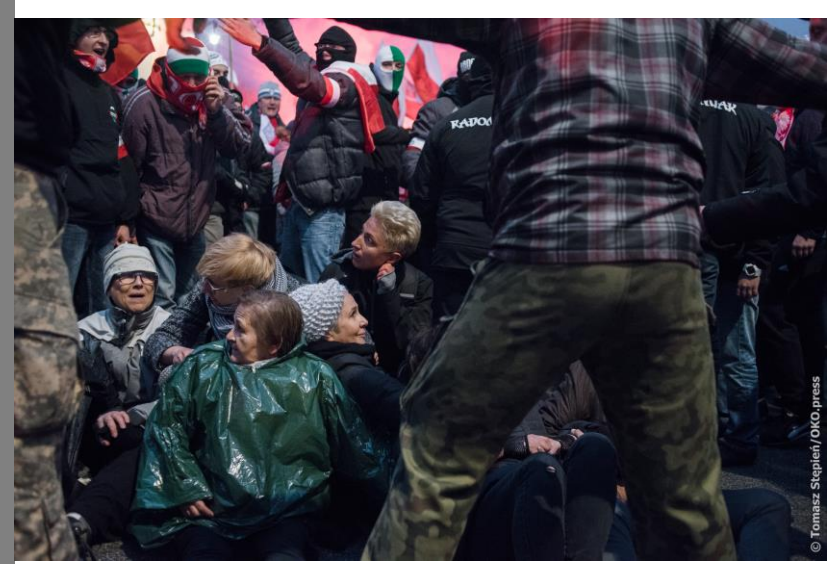
14 women attacked during Independence march protest on 11 November 2017

On 5 December 2017, the police authorities informed Amnesty International in a letter that the police operations on 11 November addressed the situation adequately and within the limits of the law.<sup>225</sup>