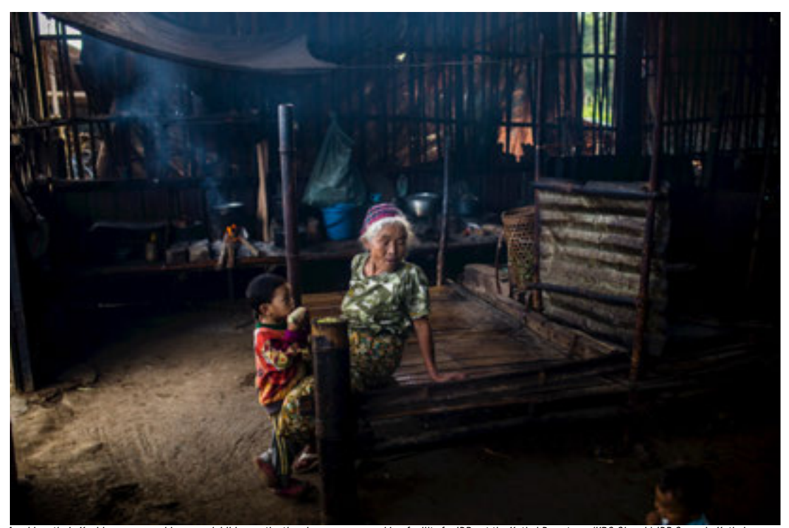
An older ethnic Kachin woman and her grandchild pass the time in a common cooking facility for IDPs at the Kutkai Downtown (KBC Church) IDP Camp in Kutkai, northern Shan State, Myanmar, 28 July 2017.

Neither the creation of a new sub-committee or group on older people's rights, nor the systematic inclusion of one or more older people on a camp committee, will, on its own, address the issues outlined in this chapter or in the preceding chapter on the Bangladesh refugee camps. But it will better ensure that campin-charge officials like the one from Myitkyina Township cited above hear older people's voices and their ideas for responding to their specific needs. It will also, as importantly, see and treat older people as resources and essential participants in the decisions being made for everyone living in the camps.