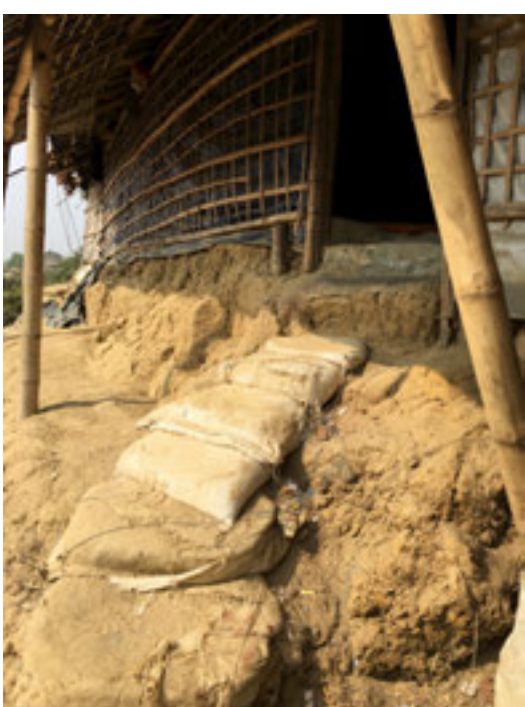
The path leading to the shelter of the 90-year-old man in Camp #11, Bangladesh, 16 February 2019

In response to questions on latrine accessibility, IOM, which has led on site management, said the "high density in the camps" as well as many areas being "highly vulnerable to landslide or flooding" were limiting factors in choosing locations to install latrines. 201 Several senior humanitarian workers involved in WASH told Amnesty International that, because of how overstretched the response has been, issues of inclusionincluding for older people and people with disabilities—have often not been prioritized.<sup>202</sup> The IOM response indicated similarly, noting that "due to the short timeframe and high demand for WASH services during the initial influx, the WASH unit was not able to meet the requirements of any specific groups' needs," focusing instead on "needs based on the total population in each camps," in particular by trying to get latrines installed within 50 metres from households and at least 10 metres from water sources. 203