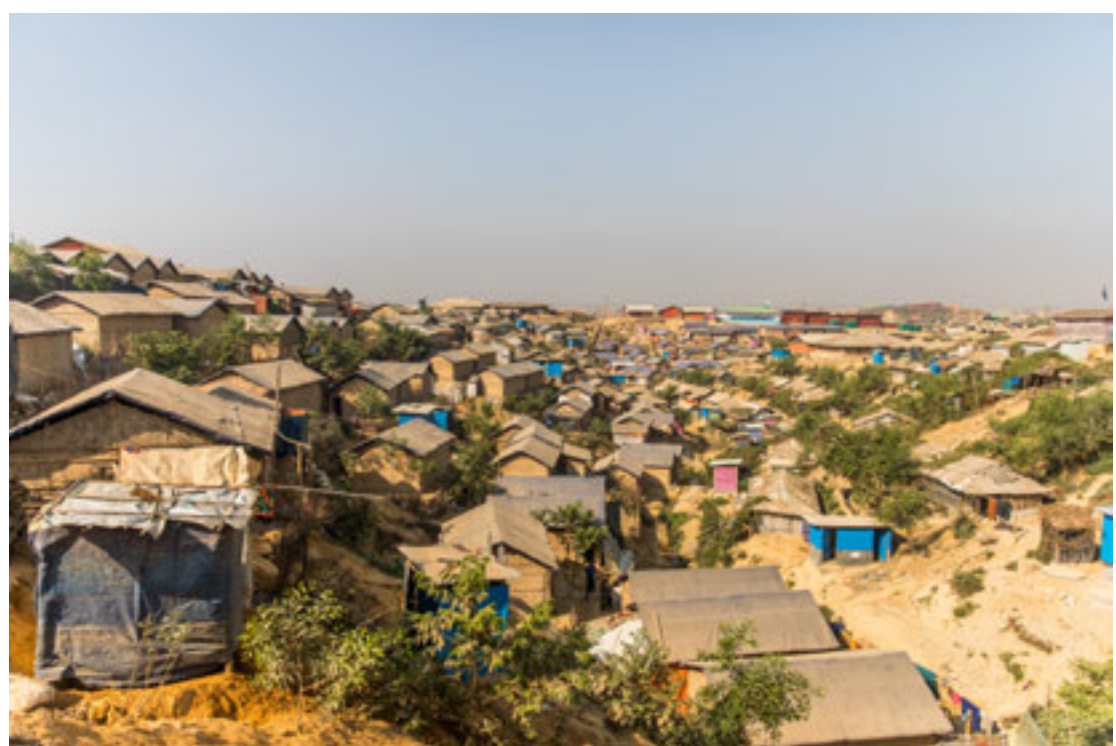
Shelters are packed together in the refugee camps, up and down hills. The terrain is difficult for some older people, particularly those with reduced mobility, which brings challenges for accessing latrines, distribution sites, and health facilities, Bangladesh, 20 February 2019.