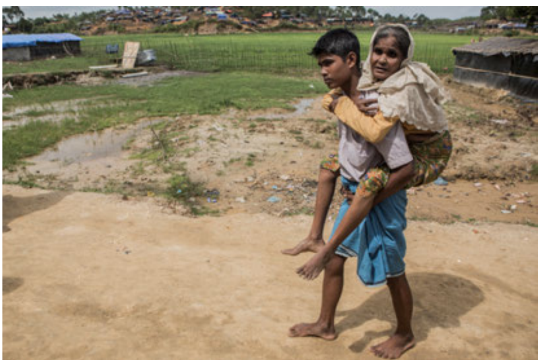
A boy carries an older Rohingya woman in the refugee camps in Bangladesh, 28 September 2017.

He had not heard news of his grandfather in the 18 months since, but assumed he died there on the path. "Sometimes my relatives here, they ask me, 'How could you leave behind your grandfather?" the grandson recalled, tearfully. He said he had seen around ten other older people who were left behind along the path, huddled in blankets similar to what was used to transport his grandfather.88