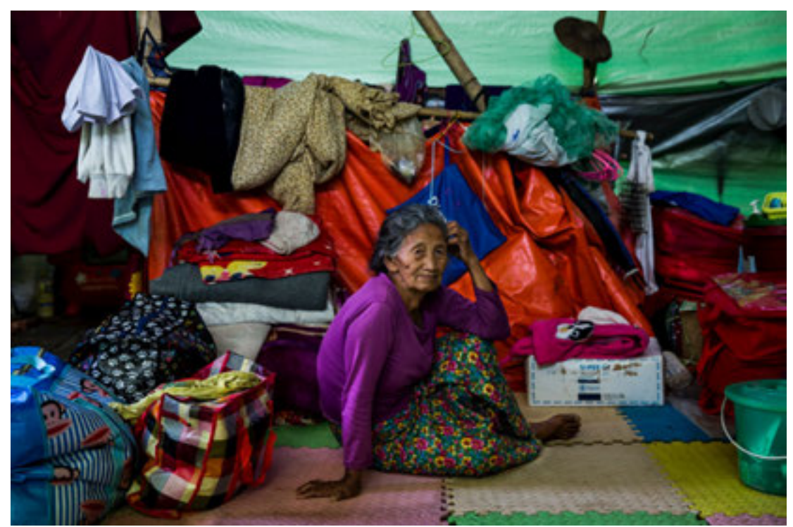
An older ethnic Kachin woman sits in her shelter in Jaw Masat IDP Camp, Myitkyina Township, Kachin State, 10 December 2018