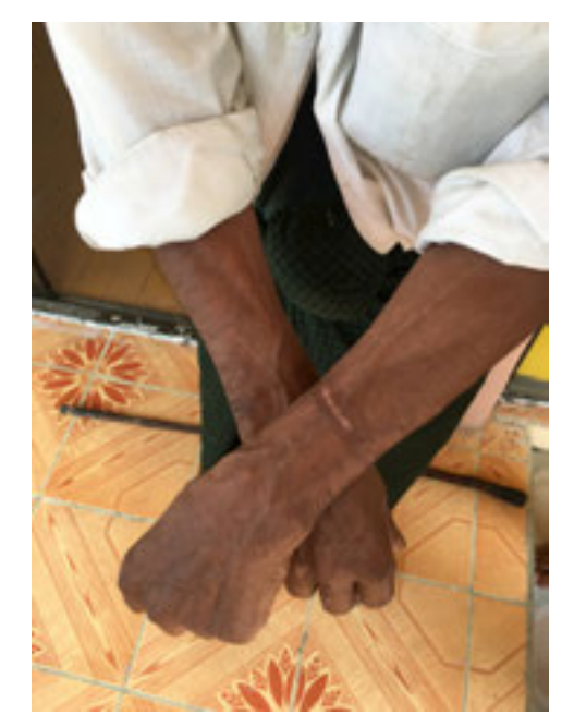
A 67-year-old ethnic Rakhine man shows a scar from when Myanmar soldiers bound his wrists with rope and tied him to a wooden pole for hours. 30 March 2019.

"When I got to where the captain was, the soldiers tied my hands... behind my back, with the rope that's used for cattle. I was tied to a wooden pole at the base of a house. They asked