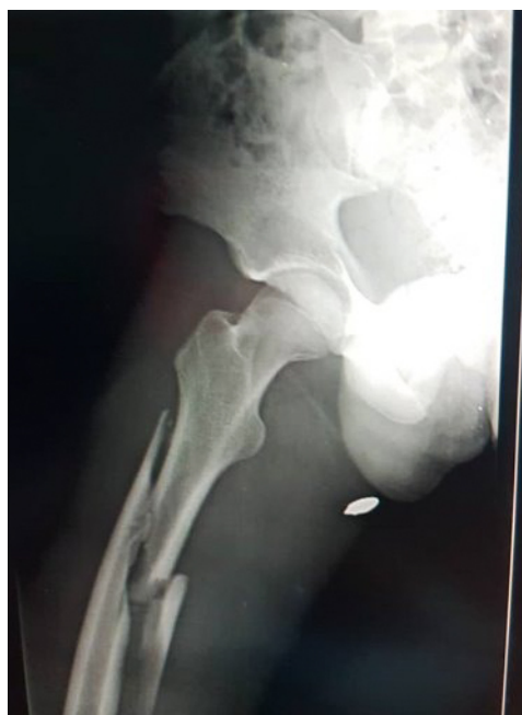
M.A.X.'s X-ray taken at the Dr José María Benítez de la Victoria Hospital, January 2019.

The jurisprudence of the Inter-American Court has established that, in addition to the absolute demonstrable necessity of using lethal force, its use must be proportionate to the level of resistance offered at any given moment and “the level of cooperation, resistance, or aggressiveness” in order to “use tactics of negotiation, control or use of force, as appropriate”. 114 The details of this case indicate that the GNB used lethal force almost immediately, in order to enable road traffic to circulate and when the blockade posed no risk or threat to the lives of the officials.