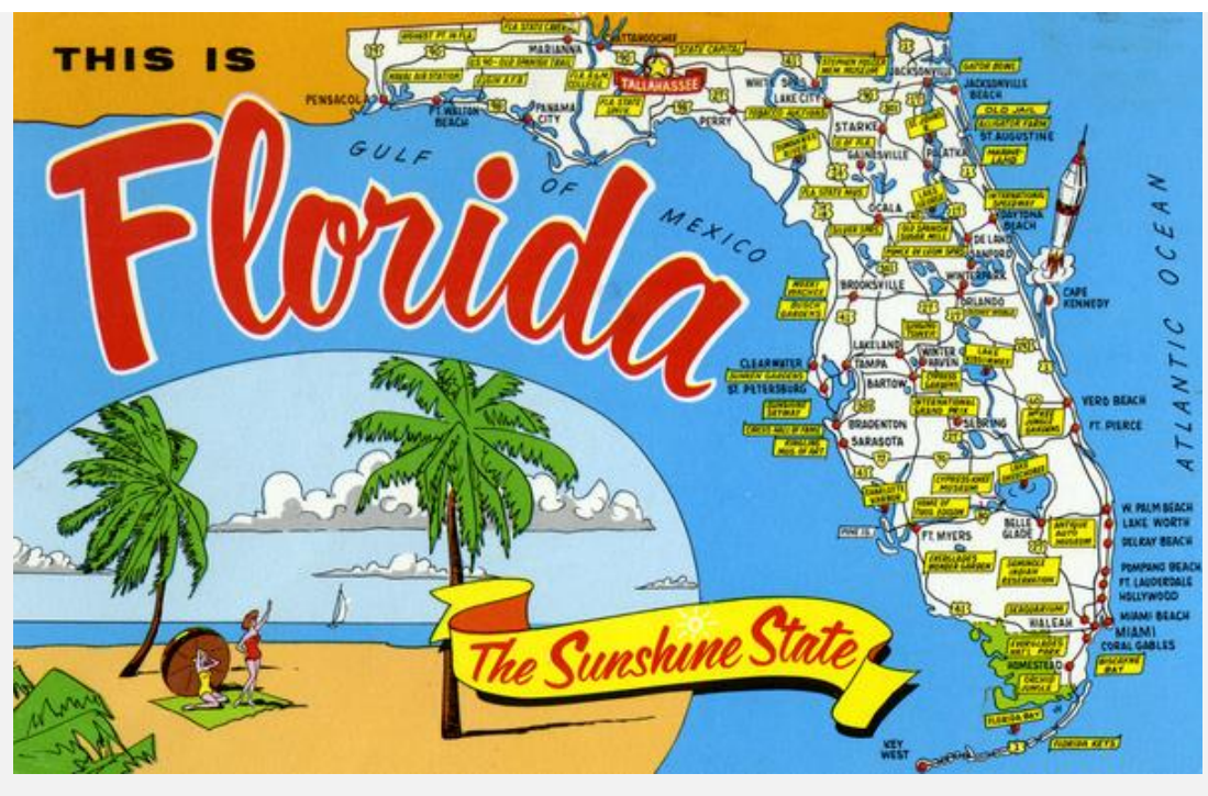
Pre-1975 postcard.