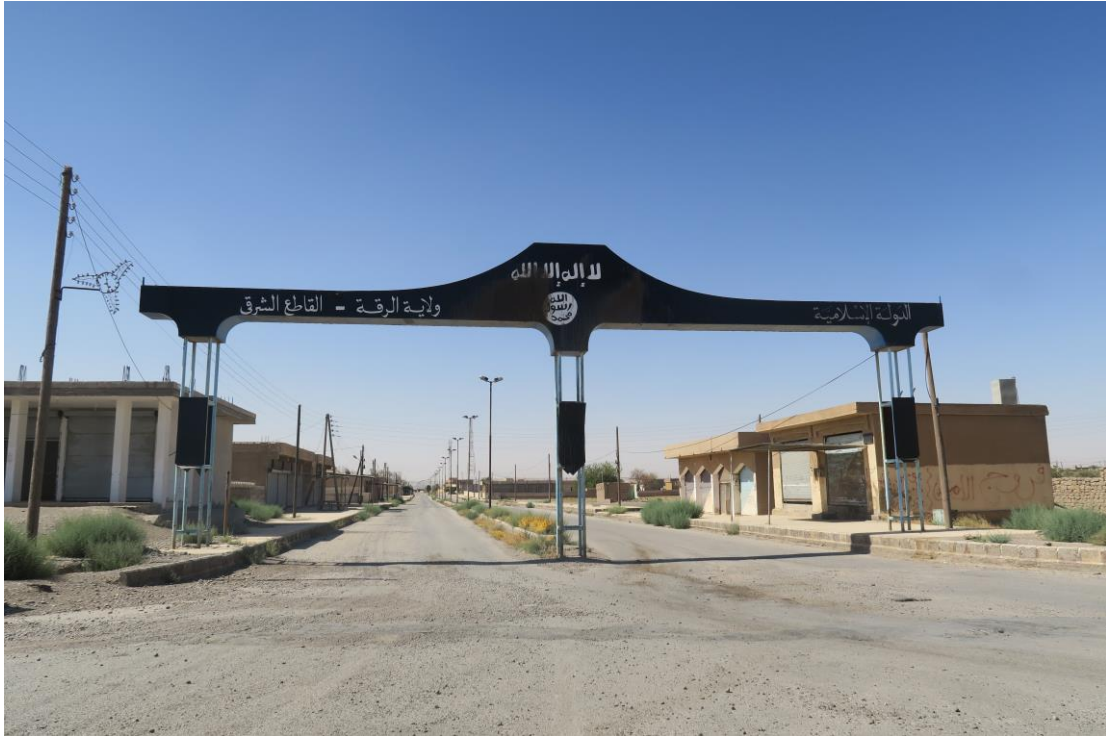
Leftover of so-called "Islamic State caliphate" east of Raqqah, now deserted.

Those who cannot afford to pay smugglers have one of two choices: either stay at home and risk being bombed or getting caught in the crossfire, or attempt to leave on their own and by so doing facing an even greater level of risk being killed by IS fighters or by the IS' mines and booby-traps.