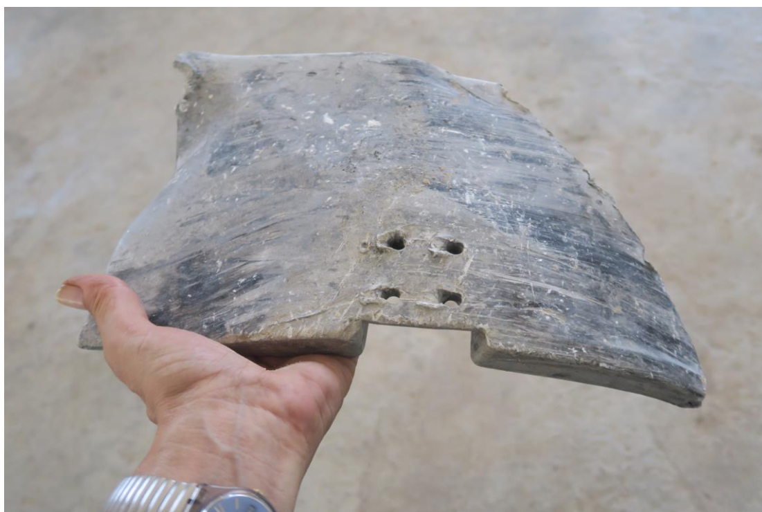
Fragment of a guidance fin from an American-designed Joint Direct Attack Munition (JDAM), which is a GPS-guided air-dropped bomb. From one of the bombs used in an air strike in Hukmya/Salhiya area northwest of Raqqa killed 14 members of a family and severely wounded two others on the evening of 11 May 2017. Eight of those killed in the attack were women and five were children. The two who were wounded were both children.

Amnesty International researchers visited the site and from the pattern of destruction there seems little doubt that the house was destroyed by air strikes. At the site, the organization’s researchers recovered a fragment which weapon experts identified as a guidance fin from an American-designed Joint Direct Attack Munition (JDAM), which is a GPS-guided air-delivered bomb. 28 It is however not clear why the house was targeted. According to the two survivors of the strike, two children aged 14 and 15, no one was in the house other than the family members who lived there – eight women, seven children and one man. Amnesty International could not establish whether IS fighters might have been hiding in or launching attacks from the fields around the house before/at the time of the strike. However even if this was the case, it would not have constituted ground for targeting a house full of civilians.