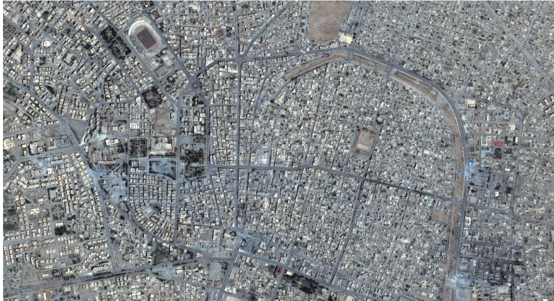
Raqqa Old City overview. Imagery taken on 2 June 2016.