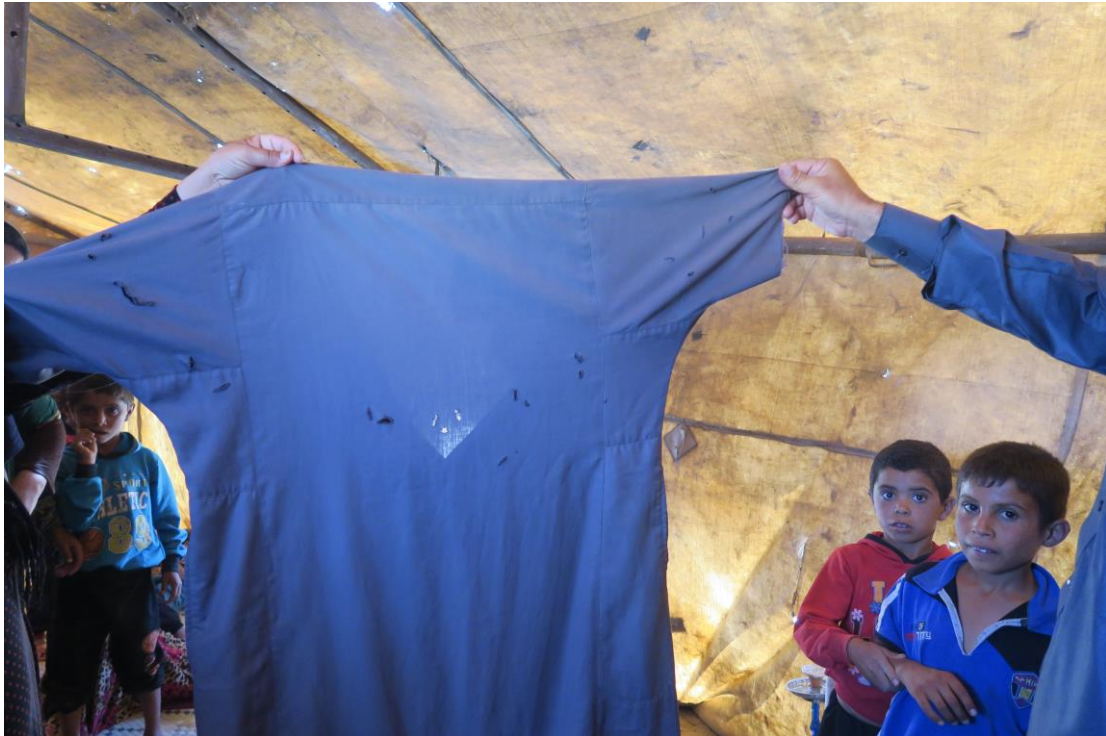
Survivors of cluster bomb attack by Syrian government forces in displaced people's shelters south of Raqqa show Amnesty International clothes torn by cluster bombs shrapnel.

Amnesty International that the message was clear; they would be safe by the water. With the threat of imminent attacks on their towns and villages, residents fled, with many ending up in makeshift camps between the Euphrates and its subsidiary irrigation canals. However, those shelters too soon came under attack.