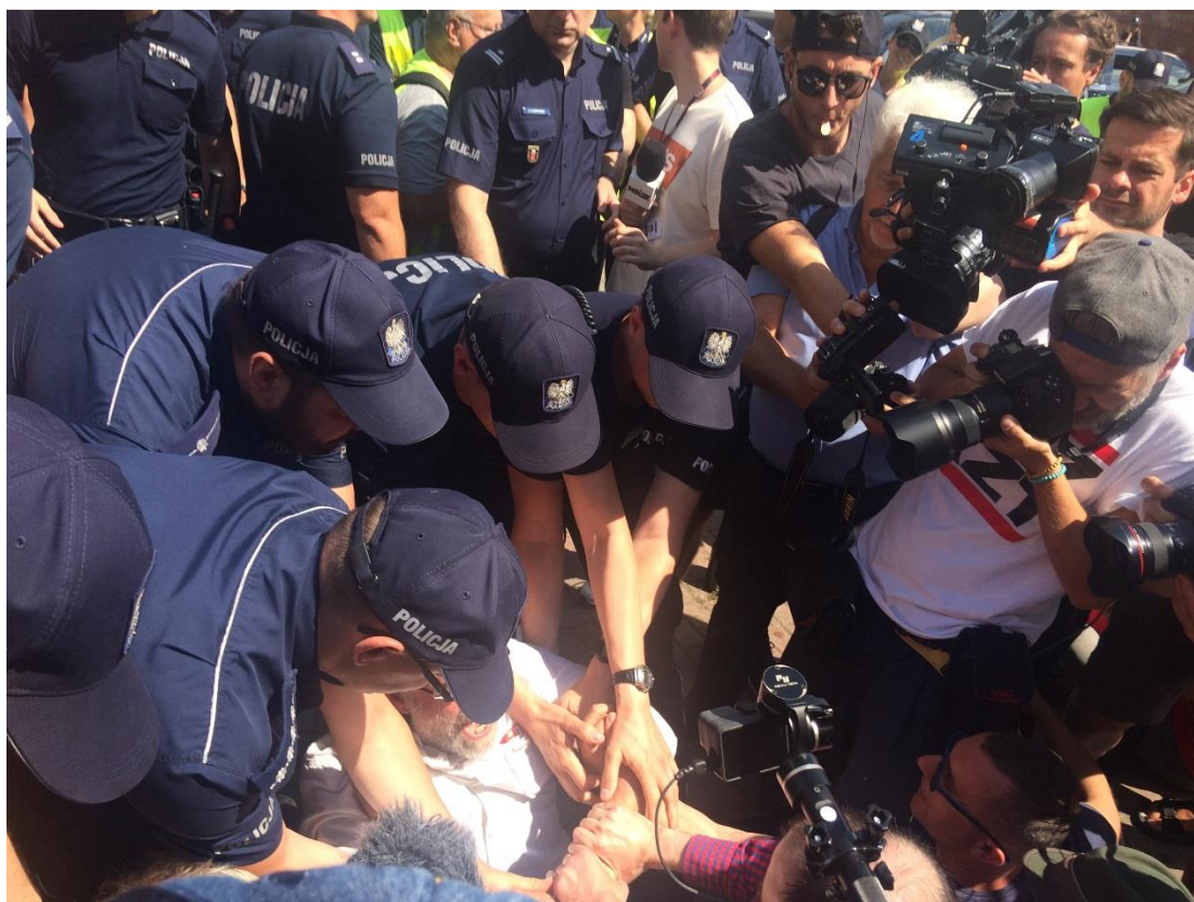
Police intervened in a peaceful spontaneous assembly at the headquarters of the Law and Justice party on Nowogrodzka Street on 24 July 2017. The assembly was not obstructing traffic and the police initially refused to provide grounds for the intervention against the protesters.

On 24 July during a spontaneous assembly at the headquarters of the Law and Justice party on Nowogrodzka Street, about 30 to 40 persons from a civil society group, Obywatele RP, and other groups held a protest under a banner that read “Free Courts, Free People”. 38 The protesters gave speeches with the use of a microphone with loudspeakers and a megaphone.