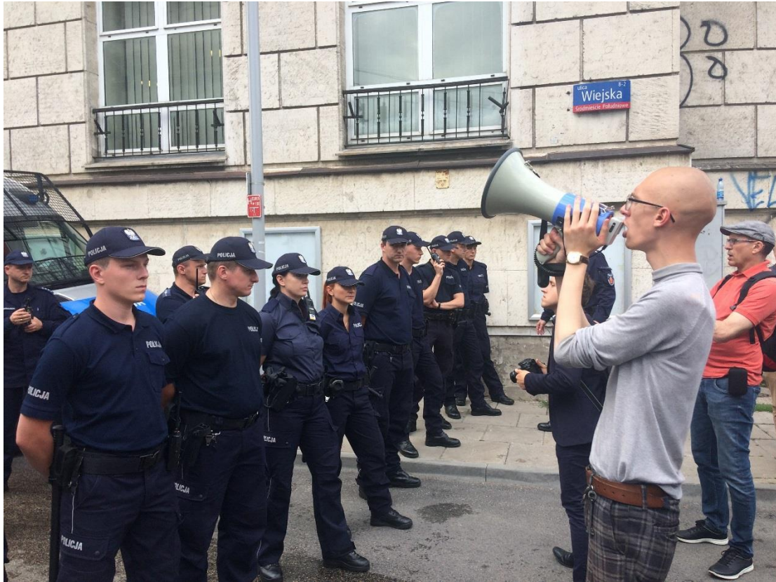
Police cordoned off an access road to the Parliament, Wiejska Street, at one end on 20 July 2017. Activists called on the police to release the protesters who were apprehended after they climbed through the fences separating the street from the area around Parliament.

An activist who did not participate in the protest and was standing on one of the exit roads taking pictures stated that the police physically assaulted her: “I was just standing there and one police officer grabbed me without any warning and pushed me against a traffic light post. He hit me in the face. I wasn’t resisting... After that, more police officers came to the site, they completely blocked Górnośląska Street and kettled me there.” 17 The police subsequently told the media that the activist did not have any evidence to support her allegations of police abuse. 18