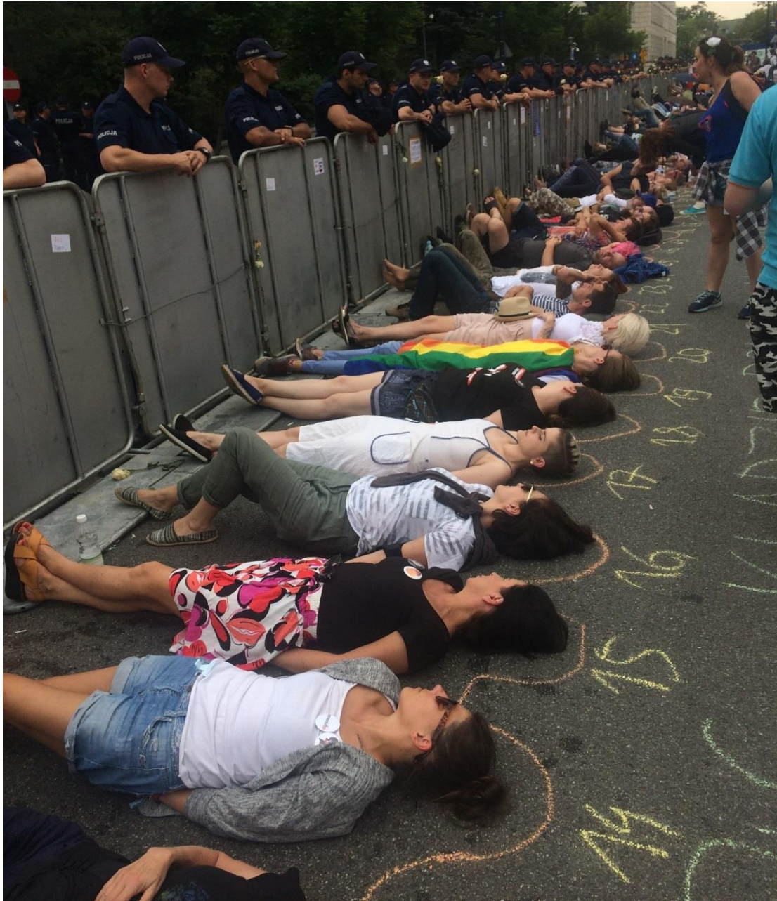
Activists mourning the “death of democracy” at the Parliament on 20 July 2017 after the announcement that the Sejm had adopted the amendment to the Law on the Supreme Court.

Protesters featured in this report are referred to by their real first name with the exception of a small number of individuals who preferred to remain anonymous for fear of potential negative consequences to their personal and professional lives. The names of protesters who lodged complaints against the police are mentioned in full with their informed consent.