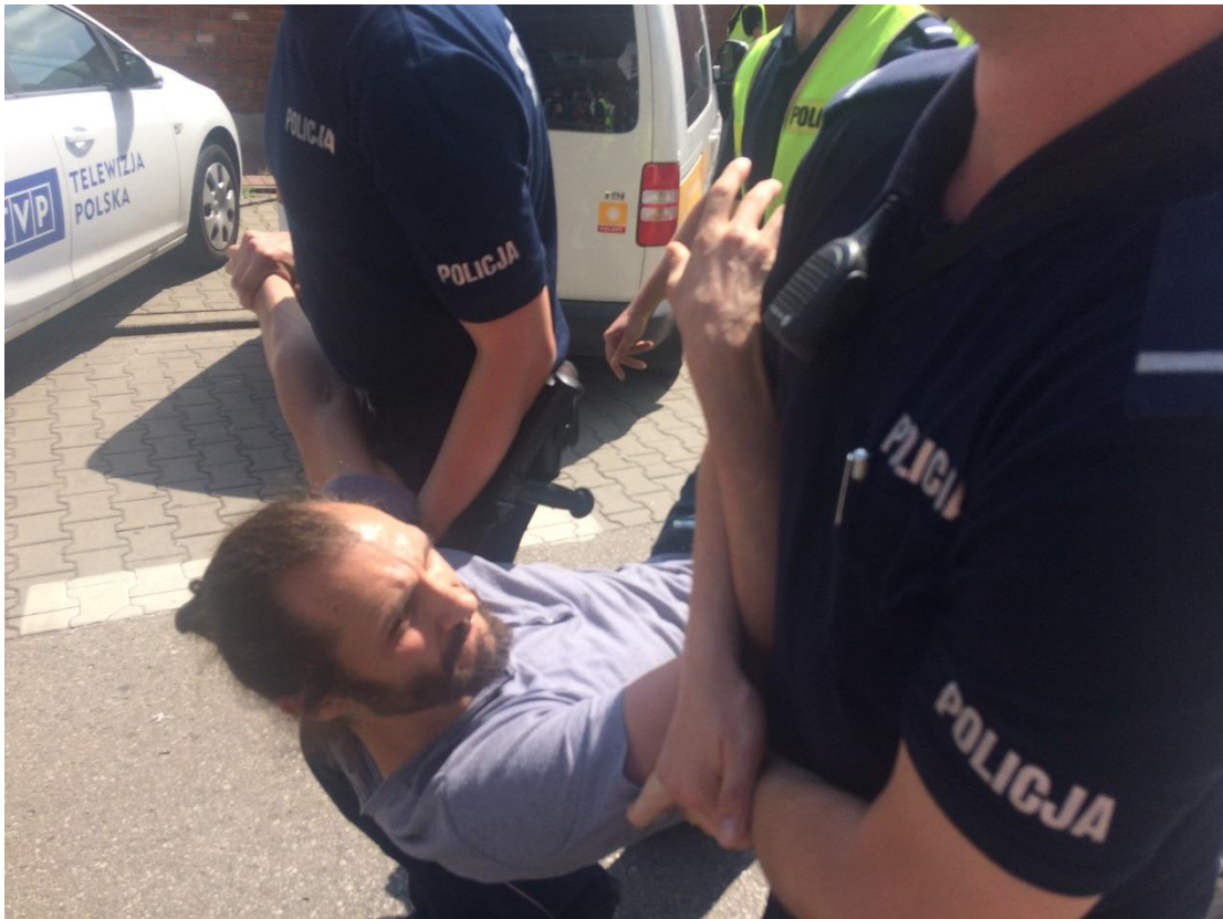
Police removed a peaceful protester at the headquarters of the Law and Justice party on 24 July 2017. Protesters were initially not given an explanation for this action against them and were held in police vans for about 90 minutes.

and only started to check their IDs about after 40 minutes. 40 This raises concerns over arbitrary deprivation of liberty that interfered with the protesters' right to freedom of peaceful assembly. Nine out of ten protesters held by the police during the protest on Nowogrodzka Street on 24 July filed a complaint against the police for unlawful arrest ( zatrzymanie ). 41