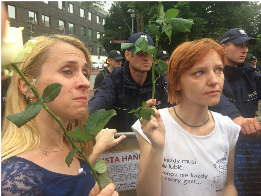
Protesters weeping in Warsaw at the Parliament after the announcement that the Sejm had adopted the amendment to the Law on the Supreme Court on 20 July 2017.

It was on 12 July 2017, shortly before midnight, that the amendment to the Law on the Supreme Court was put on the agenda of the Parliament. This served as the trigger for people, who came out to protest in large numbers. The majority of MPs of the lower chamber of the Parliament (Sejm) voted in favour of the amendment on 20 July. The news was met with outrage and sadness among the protesters assembled at the barriers on the main access roads to the Parliament. The Minister of the Interior told the media the next day that the protesters' demands amounted to a "call for the demolition of the democratic order" and that the feistiest protesters would be severely punished. One protester speculated that a number of those demonstrating against the government's moves to undermine the judiciary would eventually end up in jail.