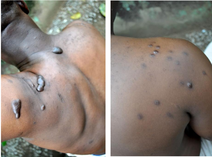
Burns from melted plastic on the bodies of former detainees in Abidjan.

The systematization of detention in unrecognized places of detention and incommunicado detention has facilitated the use of torture and other ill-treatment. A very large number of prisoners and former prisoners interviewed by Amnesty International described in detail the torture which they suffered and their coherent narratives show that these practices are essentially used to extract "confessions" but also to punish and humiliate individuals regarded as supporters of former President Gbagbo.