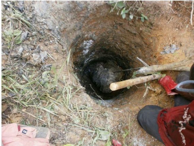
Some bodies were exhumed in this well.

in the presence of the Ivorian and UN security forces, began emptying a dozen wells, located on the outskirts of Duékoué which reportedly contained other bodies. However, these searches were stopped reportedly because of a lack of suitable equipment.