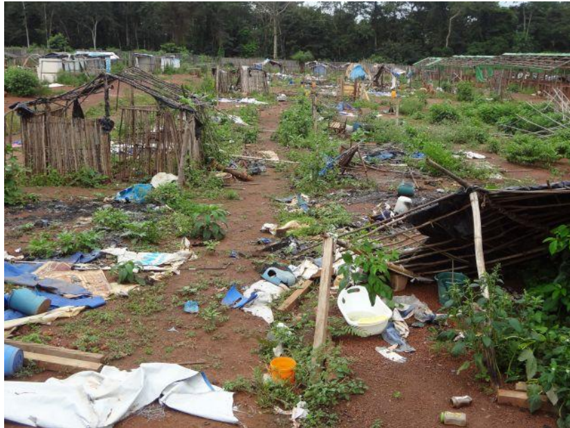
Nahibly Camp two months after its destruction, in September 2012.