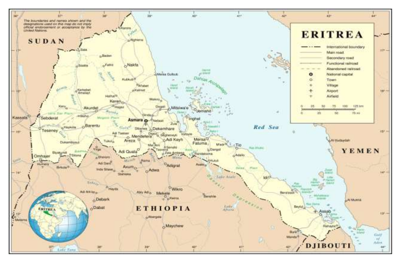
Map of Eritrea.