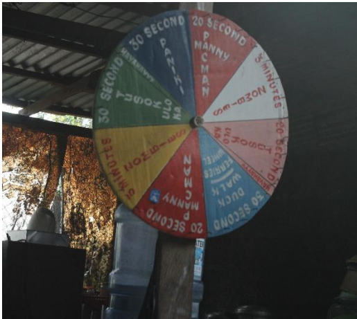
Fig. 4 – A "wheel of torture" at an undisclosed police safe house in Laguna province, south of Manila, Philippines.

In January 2014, the Philippines' Commission on Human Rights (CHR) exposed a secret detention facility in Laguna, a province south of the capital, Manila, in which police officers appeared to be torturing detainees for entertainment. The CHR found a large roulette wheel on which were written descriptions of various torture positions. If the wheel was spun and landed on "30 second bat position", for example, this meant that the detainee would be hung upside down (like a bat) for 30 seconds. "20 second Manny Pacquiao " meant that a detainee would be punched non-stop for 20 seconds. The existence of such a device, apparently for police officers' entertainment, clearly demonstrates the casual attitude towards torture within the police force.