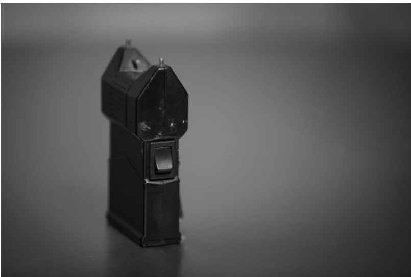
Fig. 15 – A female "asset" gave Althea electric shocks for about an hour and a half (reconstruction based on testimony).

Althea recalled that, at the DEU, the female "asset" hit her on the back and pulled her hair. Althea said the woman had an electrical device in her hand and used it to give her electric shocks for about an hour and a half until it seemed to run out of battery. Althea described her experience to Amnesty International: "Every time she used it, I would fall and I couldn't breathe. She used it on my back – the pain was intolerable – like an electric shock."