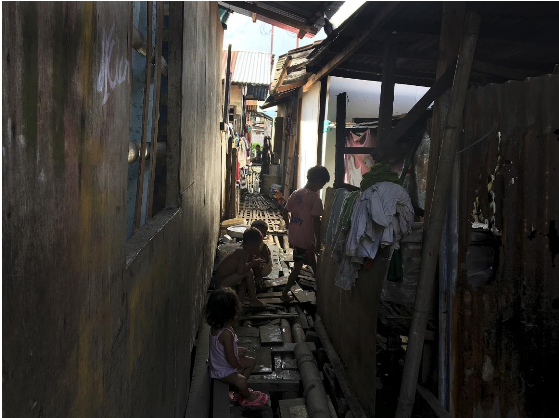
Children play, 8 December 2016, in a floating slum (exact location withheld) where one of the cases of killings by police documented by Amnesty International in Cebu Province took place. Many of the people who have been targeted in the anti-drugs campaign are poor.