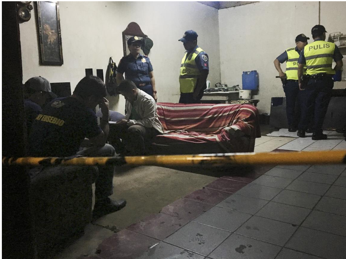
Policemen wait on the ground floor of a house where four people were killed by unknown armed persons in an alleged “drug den,” 12 December 2016, Pasig City, Metro Manila. Crime scene investigators had not arrived yet to work the case—one of two incidents documented by Amnesty International delegates observing journalists’ night-shift coverage of police activities.

Many killings by unknown armed persons are shockingly brazen. In a town in Cotabato Province, a witness interviewed by Amnesty International watched as a friend was killed in November 2016 while working at a cafeteria outside a local school. Students were packed in for the lunch hour, as the assailant pulled out a gun. The witness recalled thinking she “was in a movie, I thought it was a joke, that it was a toy gun. The gunman put the gun to the back of [his] head. ... Then there was a loud sound. It sounded like a firecracker.” 214 As the children screamed, the paid killer left with a companion on a motorcycle.