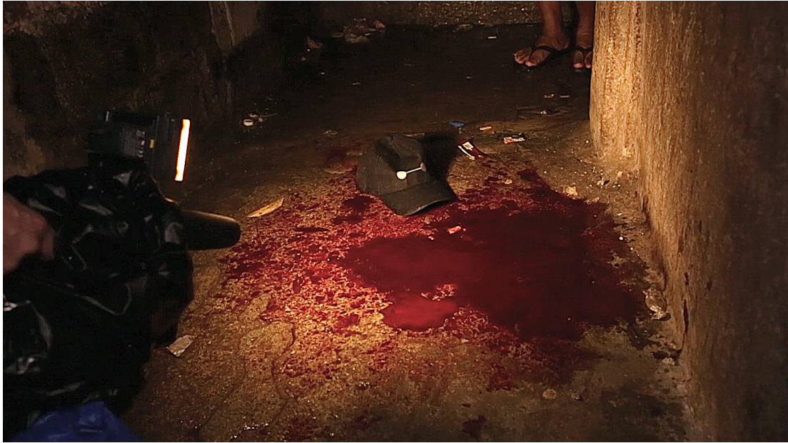
A pool of blood is filmed by a cameraman following a killing on 12 December 2016, Caloocan City, Metro Manila. The killing in a police “buy-bust” operation was one of two cases documented by Amnesty International delegates observing journalists’ night-shift coverage of police activities.

Of the 33 drug-related killings documented by Amnesty International, 20 occurred during formal police operations. The vast majority appear to have been extrajudicial executions.