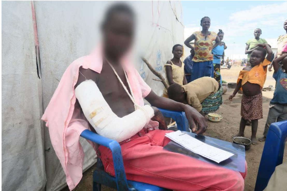
Man wounded in a market shooting on the 15 of May 2017 in Payawa, south-east of Yei