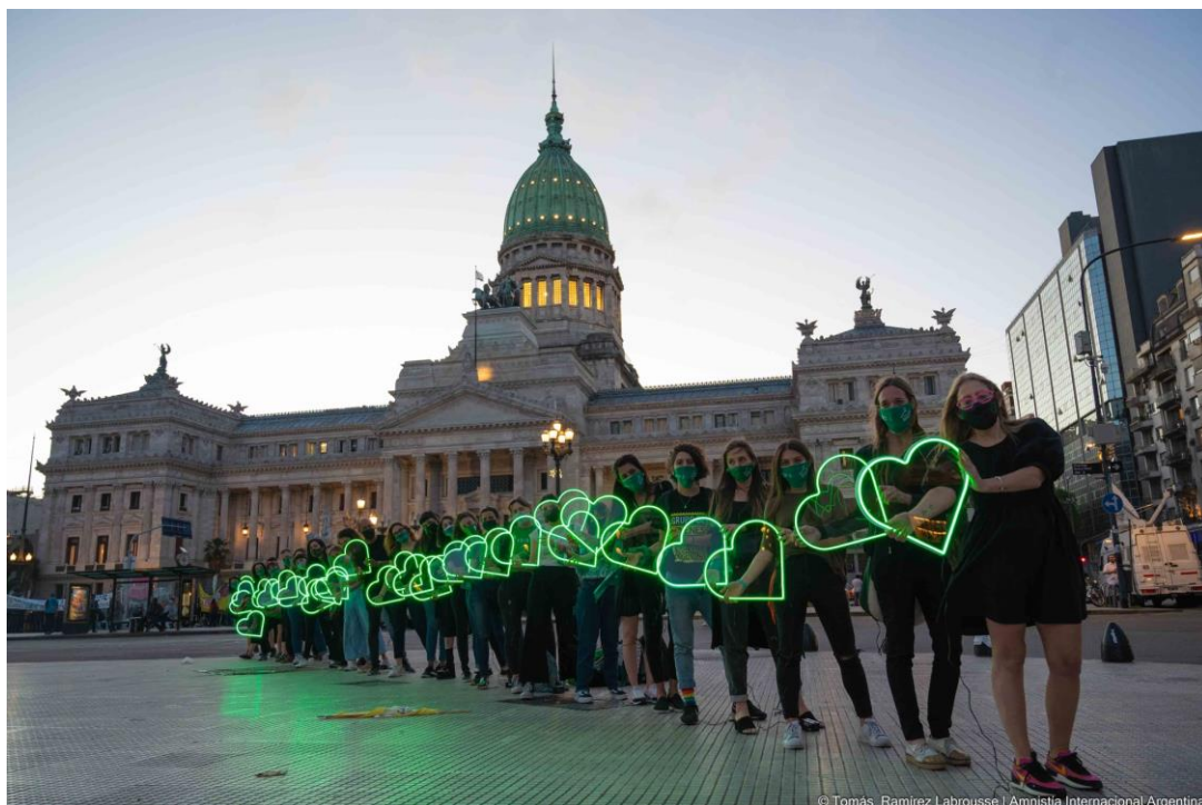
© ↑ Amnesty International Argentina action outside the Palace of the Argentine National Congress in Buenos Aires, marking the first anniversary of the legalisation of abortion in the country, 30 December, 2021 © Amnesty International / Tomás Ramírez Labrousse

“With increasing sensitization, values verification and attitudes transformation training, I hope more people will be sensitized. Increasing provider networking is important in improving the enabling environment” – Gynecologist, Nigeria