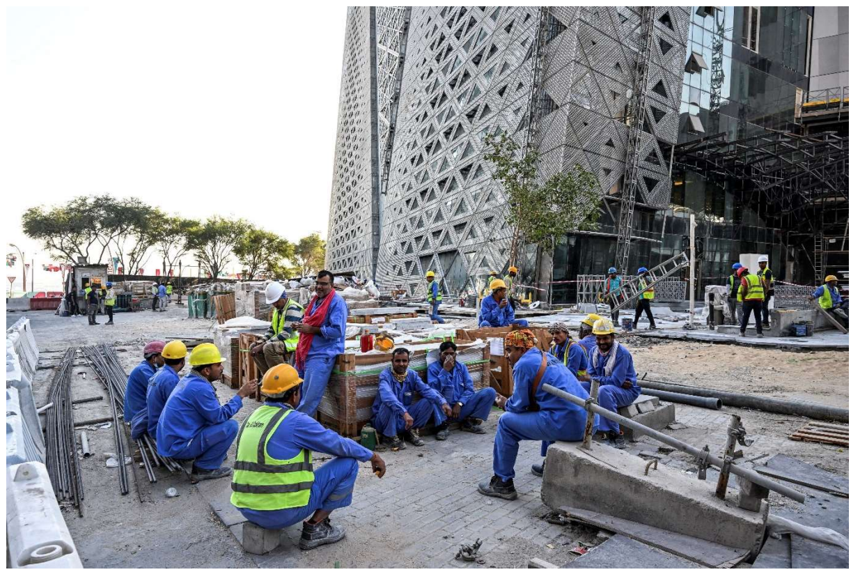
Migrant builders take a break while working at a construction site by the Corniche, in Doha, (Photo by CHANDAN KHANNA / AFP) @ AFP via Getty Images

As part of the data provided to Amnesty International regarding workers' applications to change jobs, the government provided Amnesty International with a list of reasons as to why it declined such requests, including, because new employers failed to comply with laws and permits needed to hire workers; the employer already had complaints lodged against it; or because the correct documents had not been uploaded with the application.<sup>31</sup>