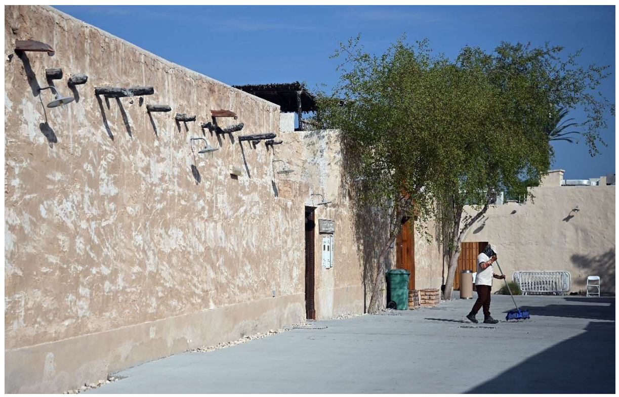
A cleaner sweeps the path near to the England team hotel, 10 miles south of Doha on November 12, 2022

The government told Amnesty International that in 2022 it had recorded a decrease in the number of people reporting to clinics with heat stress-related conditions and said that it would release data for 2023 in due course.<sup>69</sup> This had not been published at the time of writing so Amnesty International is unable to independently assess this. The government also highlighted that private security companies are obliged to implement strategies to protect their workers, but did not provide any detail on measures taken by the Ministry of Labour to ensure that outdoor security guards are adequately protected from the risks of heat stress. Further, several organizations including Human Rights Watch<sup>70</sup> and Amnesty International have long raised serious concerns about the large number of unexplained deaths in Qatar and the need for better investigation of these, while the ILO has also acknowledged the need to review the approach to collection of data around possible work-place deaths and injuries.<sup>71</sup> In late 2021, the Ministry of Labour and the Ministry of Public Health, signed a memorandum to cooperate on data collection.<sup>72</sup> However, Amnesty International is unaware of any steps yet to have been taken to improve the investigation of worker deaths, which could help prevent avoidable deaths and enable families who lost loved ones to understand what happened and claim compensation for their loss.