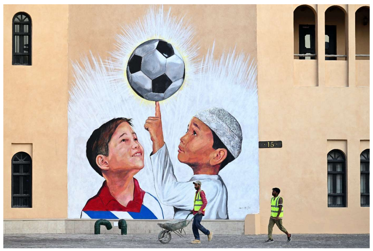
A worker pushes a wheelbarrow past a mural in Doha on November 8, 2022, ahead of the Qatar 2022 FIFA World Cup football tournament.

that the vast majority of labour complaints are 'settled in mediation', it does not provide further information about what this means in practice and what proportion of these result in migrant workers receiving their full dues.