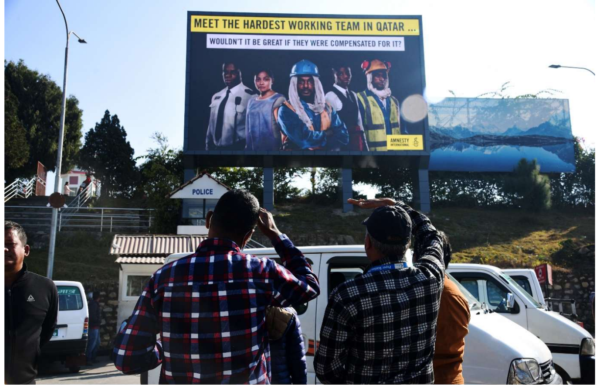
Pay Up FIFA Billboard outside Tribhuvan International Airport in Kathmandu, Nepal, December 2022.

Until 2020, Qatar's inherently abusive kafala sponsorship system imposed tight restrictions on migrant workers' freedom of movement, prohibiting them from leaving the country or changing jobs without the permission of their employer. Between 2018 and 2020, the government took important steps towards tackling two central pillars of this system by repealing for most migrant workers the requirement to obtain from their employer an 'exit permit' to leave the country, and a 'no-objection certificate' (NOC) to change jobs.<sup>25</sup>