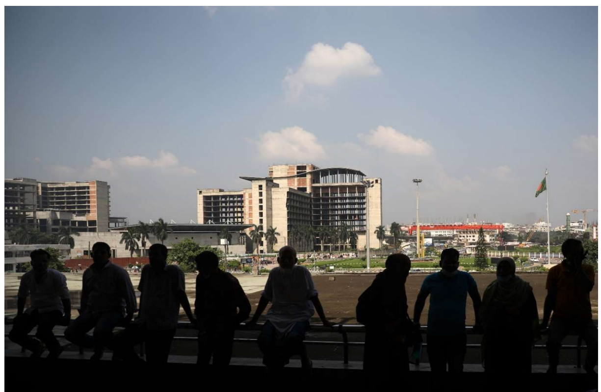
Migrant workers waiting outside Hazrat Shahjalal International airport in Dhaka, Bangladesh on Tuesday, September 26, 2021.

To combat low wages the government introduced a monthly minimum wage in 2021 which, albeit still very low, increased salaries for tens of thousands of workers. It also took steps in recent years to tackle persistent cases of wage theft by strengthening its Wage Protection System (WPS) to better monitor payment of salaries and deter businesses from late and non-payment of their employees. Nonetheless, wage theft remains the most common form of exploitation facing migrant workers in Qatar according to stakeholders interviewed by Amnesty International for this briefing.