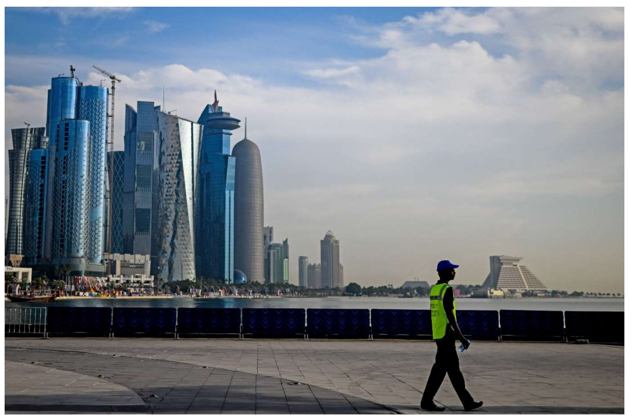
A security guard walks at the West Bay in Doha on November 30, 2022, during the Qatar 2022 World Cup football tournament.

prove its critics wrong, it should publish the findings of its review and commit to take urgent and concrete action to ensure access to remedy for victims.