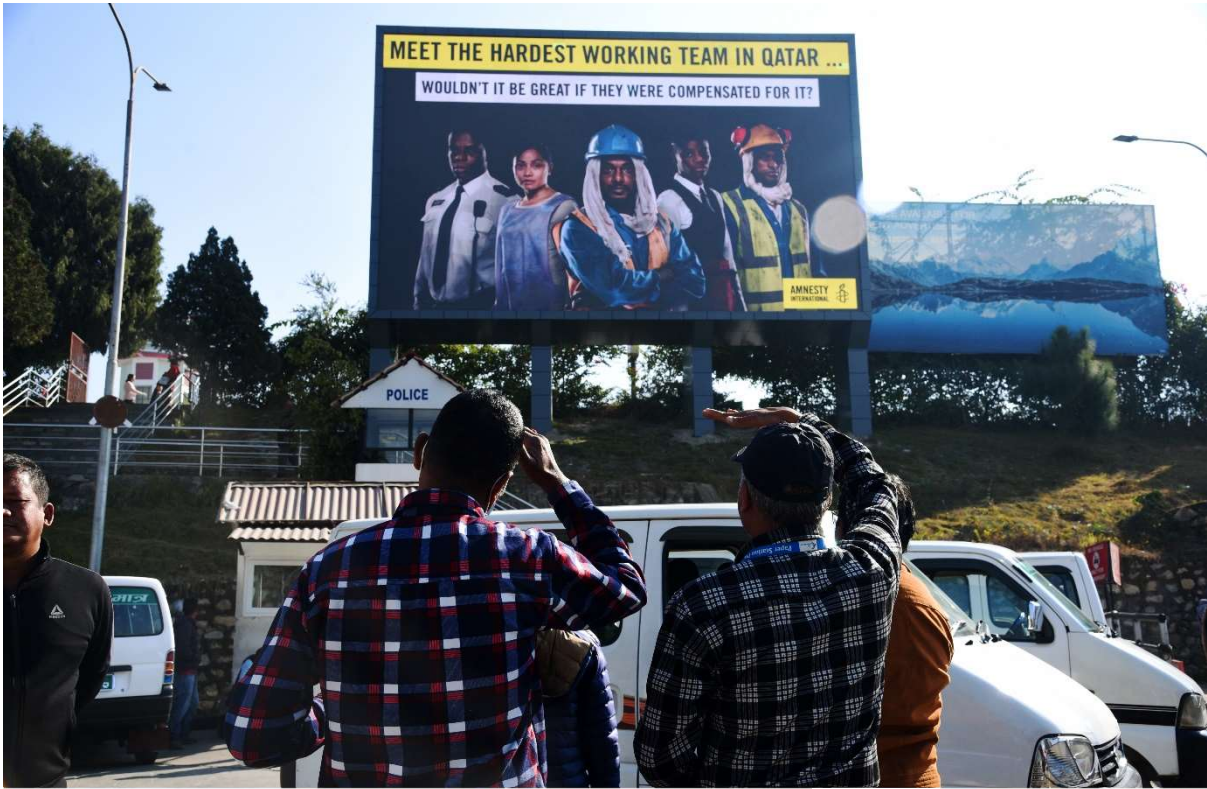
Pay Up FIFA Billboard outside Tribhuvan International Airport in Kathmandu, Nepal, December 2022. @ NagarLachhu

Until 2020, Qatar’s inherently abusive kafala sponsorship system imposed tight restrictions on migrant workers’ freedom of movement, prohibiting them from leaving the country or changing jobs without the permission of their employer. Between 2018 and 2020, the government took important steps towards tackling two central pillars of this system by repealing for most migrant workers the requirement to obtain from their employer an ‘exit permit’ to leave the country, and a ‘no-objection certificate’ (NOC) to change jobs. 25