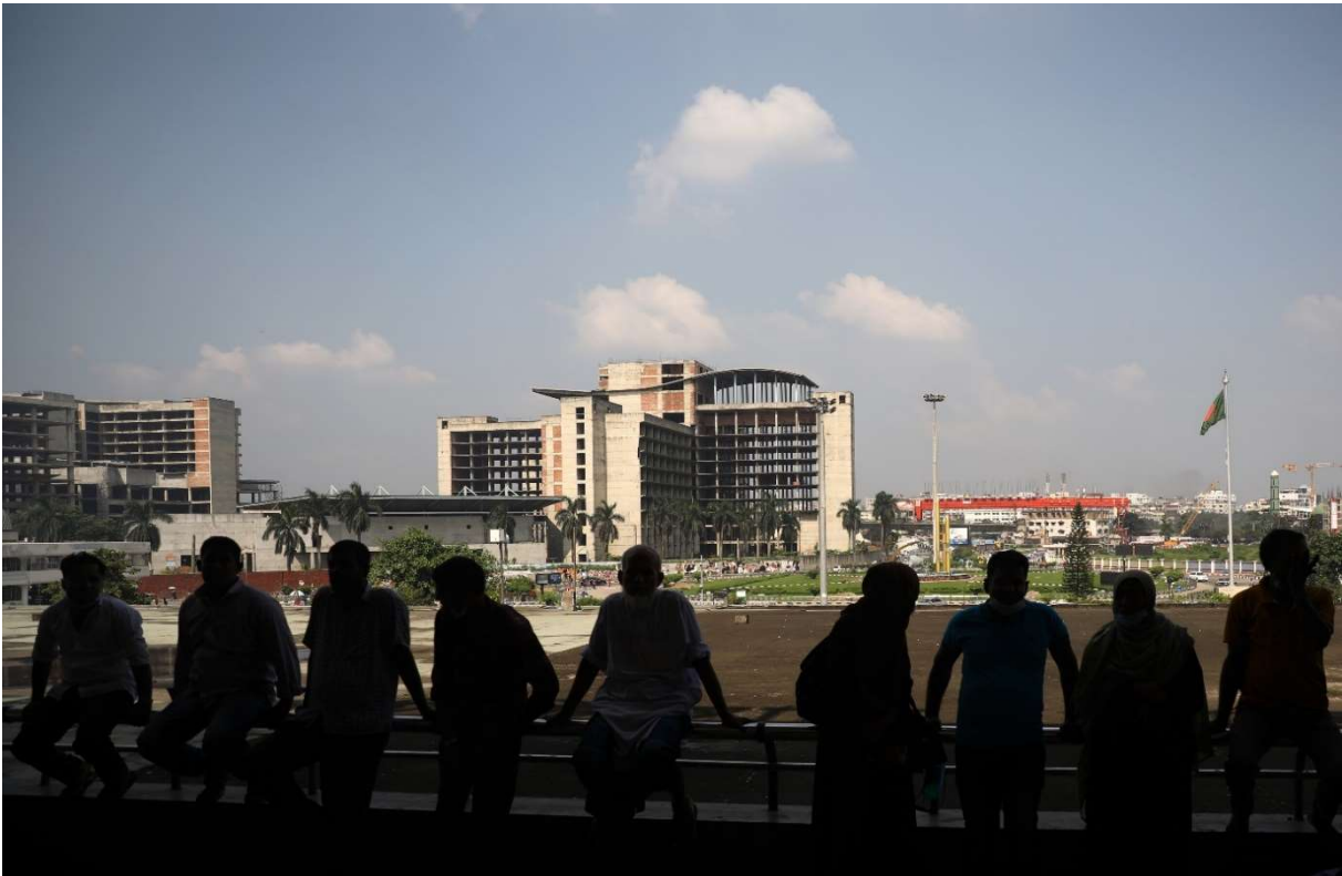
Migrant workers waiting outside Hazrat Shahjalal International airport in Dhaka, Bangladesh on Tuesday, September 26, 2021.

To combat low wages the government introduced a monthly minimum wage in 2021 which, albeit still very low, increased salaries for tens of thousands of workers. It also took steps in recent years to tackle persistent cases of wage theft by strengthening its Wage Protection System (WPS) to better monitor payment of salaries and deter businesses from late and non-payment of their employees. Nonetheless, wage theft remains the most common form of exploitation facing migrant workers in Qatar according to stakeholders interviewed by Amnesty International for this briefing.