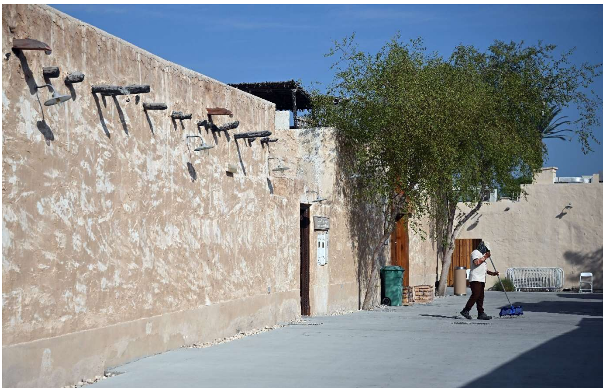
A cleaner sweeps the path near the England team hotel, 10 miles south of Doha on November 12, 2022

The government told Amnesty International that in 2022 it had recorded a decrease in the number of people reporting to clinics with heat stress-related conditions and said that it would release data for 2023 in due course. 69 This had not been published at the time of writing so Amnesty International is unable to independently assess this. The government also highlighted that private security companies are obliged to implement strategies to protect their workers, but did not provide any detail on measures taken by the Ministry of Labour to ensure that outdoor security guards are adequately protected from the risks of heat stress. Further, several organizations including Human Rights Watch 70 and Amnesty International have long raised serious concerns about the large number of unexplained deaths in Qatar and the need for better investigation of these, while the ILO has also acknowledged the need to review the approach to collection of data around possible work-place deaths and injuries. 71 In late 2021, the Ministry of Labour and the Ministry of Public Health, signed a memorandum to cooperate on data collection. 72 However, Amnesty International is unaware of any steps yet to have been taken to improve the investigation of worker deaths, which could help prevent avoidable deaths and enable families who lost loved ones to understand what happened and claim compensation for their loss.