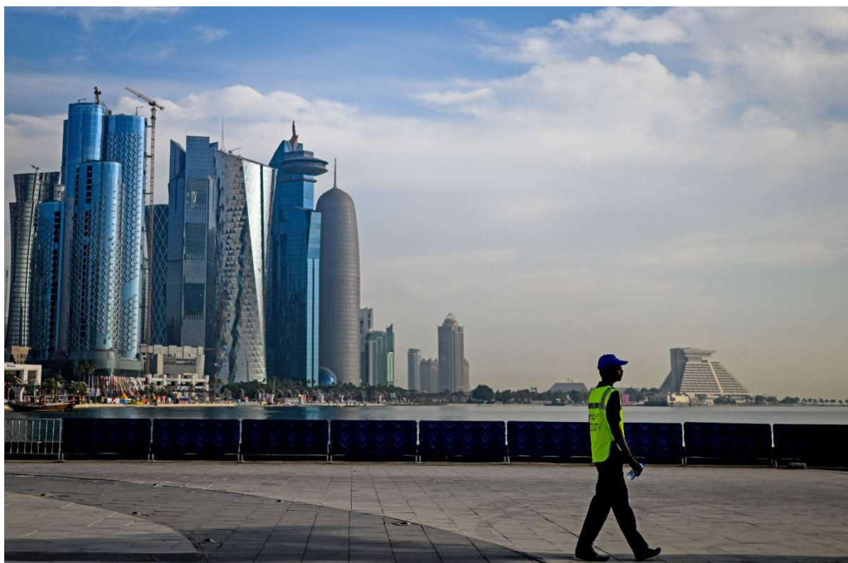
A security guard walks at the West Bay in Doha on November 30, 2022, during the Qatar 2022 World Cup football tournament.

prove its critics wrong, it should publish the findings of its review and commit to take urgent and concrete action to ensure access to remedy for victims.