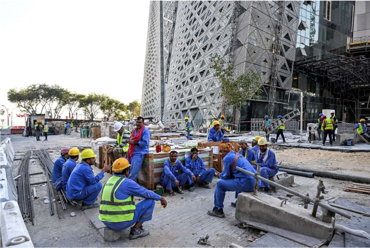
Migrant builders take a break while working at a construction site by the Corniche, in Doha,

As part of the data provided to Amnesty International regarding workers' applications to change jobs, the government provided Amnesty International with a list of reasons as to why it declined such requests, including, because new employers failed to comply with laws and permits needed to hire workers; the employer already had complaints lodged against it; or because the correct documents had not been uploaded with the application. 31