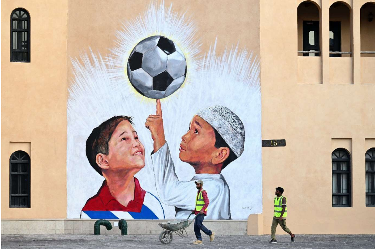
A worker pushes a wheelbarrow past a mural in Doha on November 8, 2022, ahead of the Qatar 2022 FIFA World Cup football tournament.

that the vast majority of labour complaints are ‘settled in mediation’, it does not provide further information about what this means in practice and what proportion of these result in migrant workers receiving their full dues.