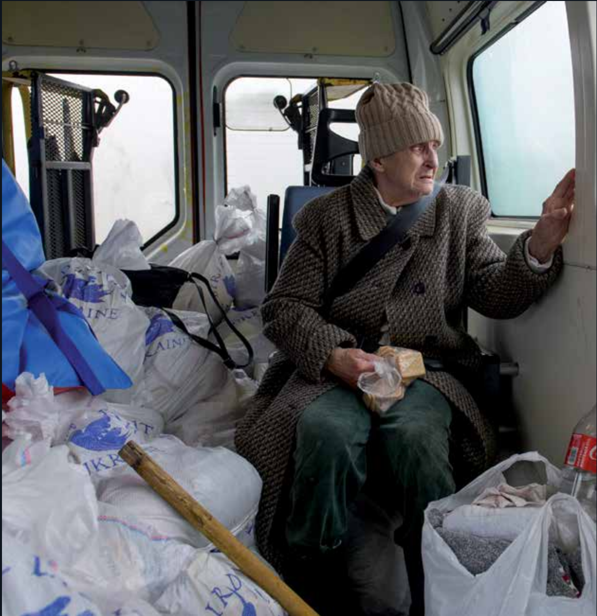
↑ An older woman with a disability being evacuated in Kharkiv region, Ukraine.