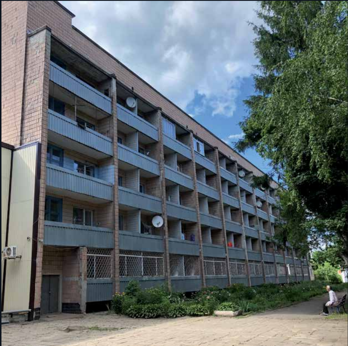
↑ An institution for older people in Ukraine