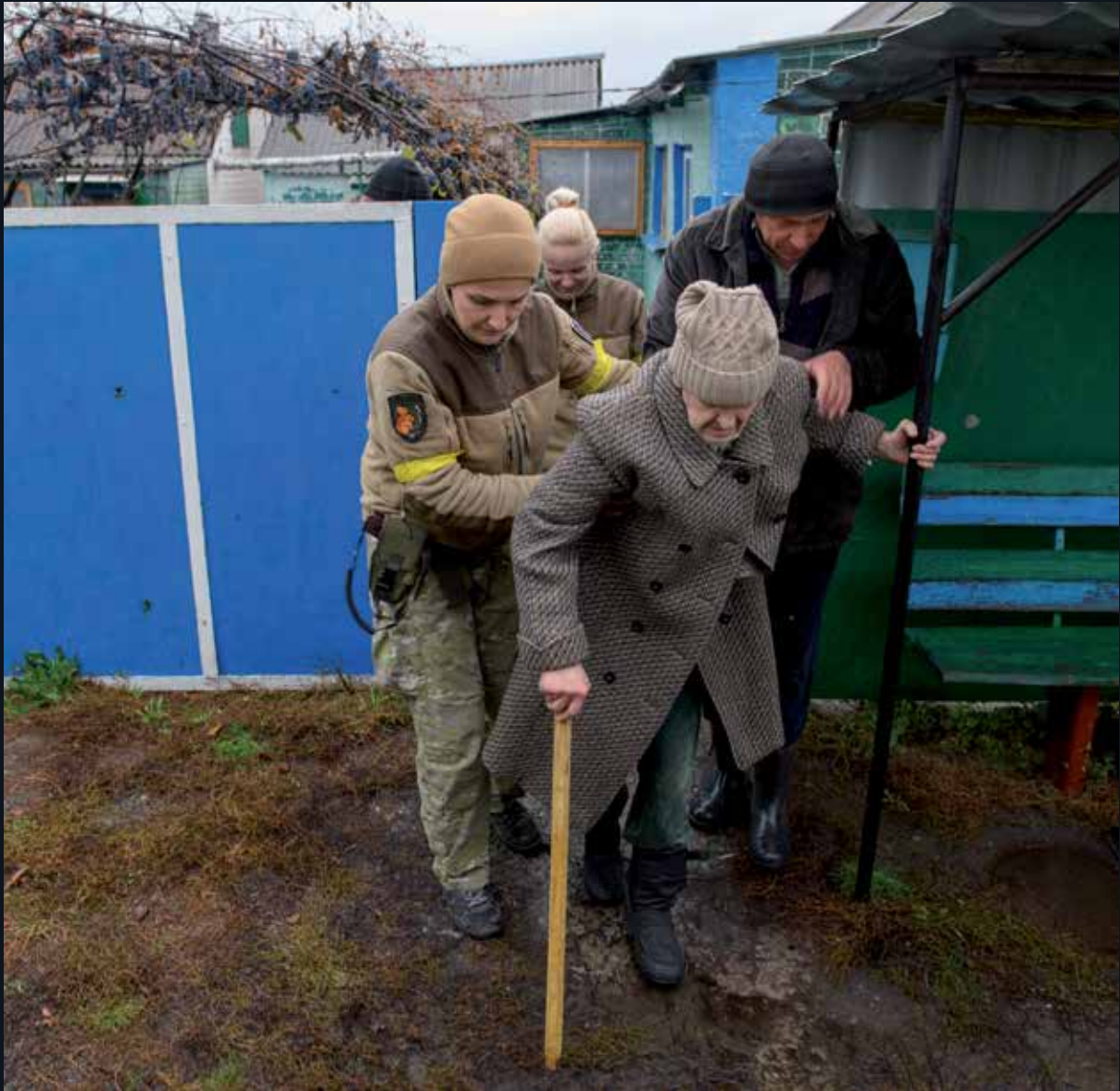
↑ An older woman with a disability being evacuated in Kharkiv region, Ukraine.