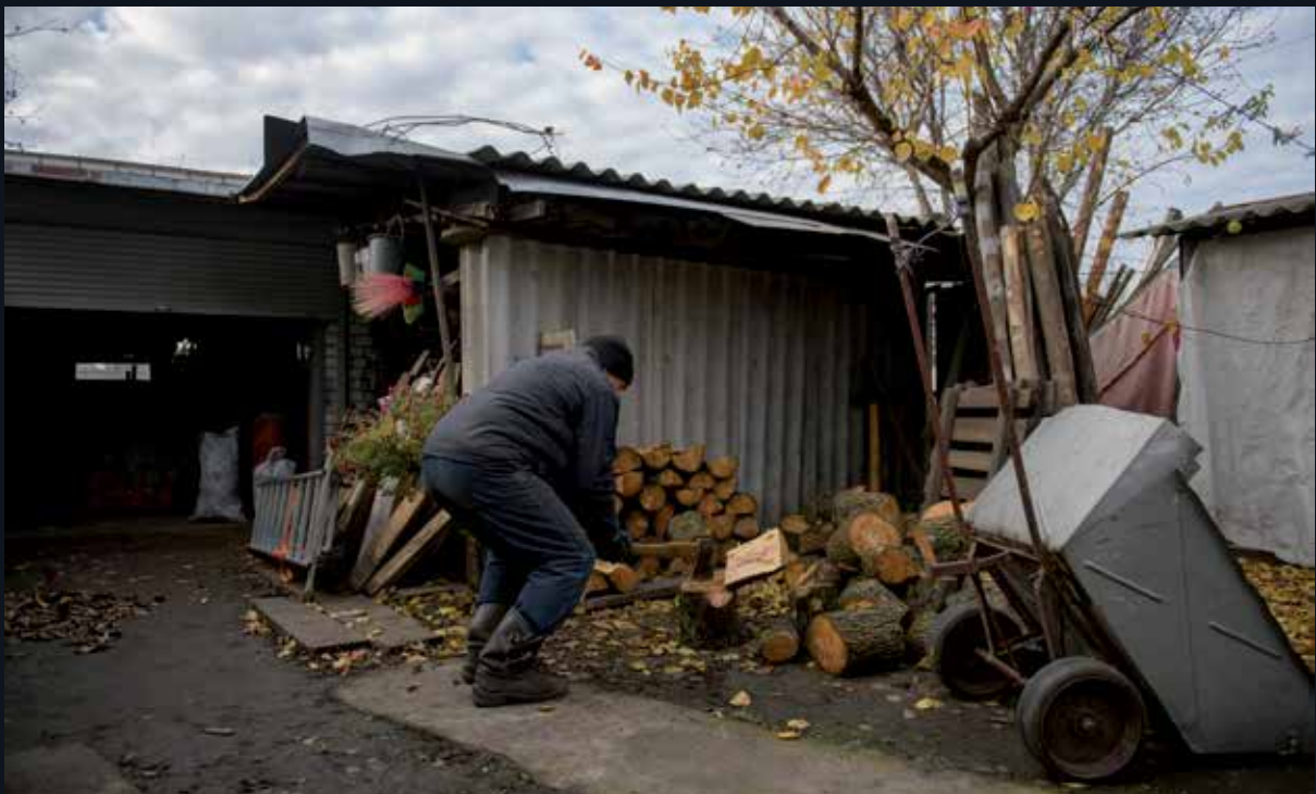
↑ An older man chopping wood because his home has no electricity or heating in Kharkiv region, Ukraine.