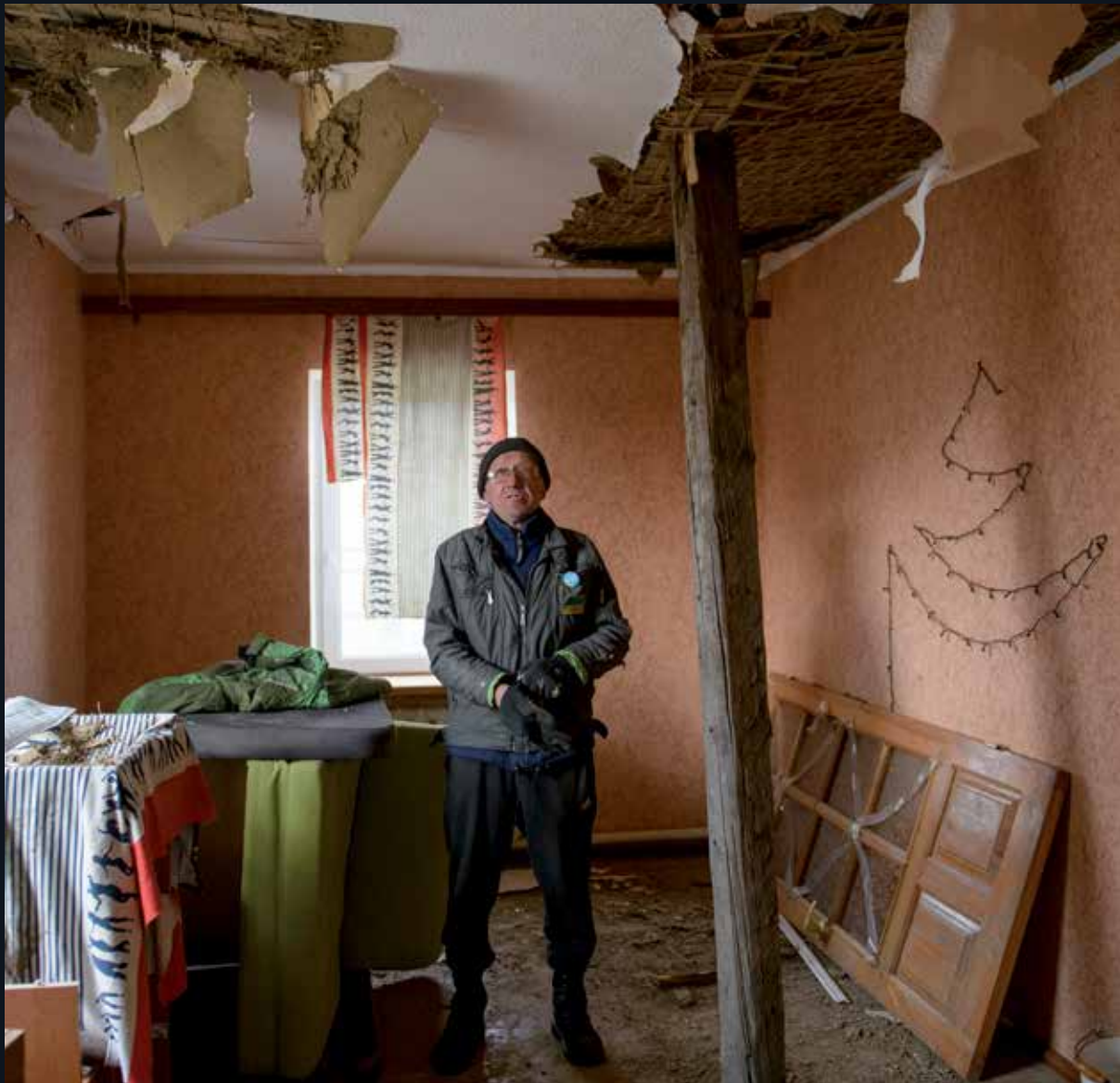
↑ An older man in his home that was damaged by attacks in Kharkiv region, Ukraine.